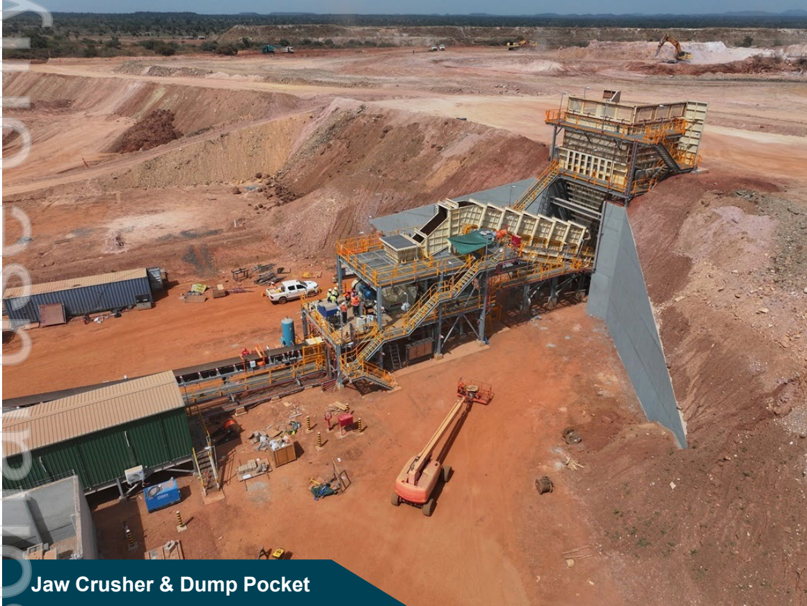
Jaw Crusher & Dump Pocket