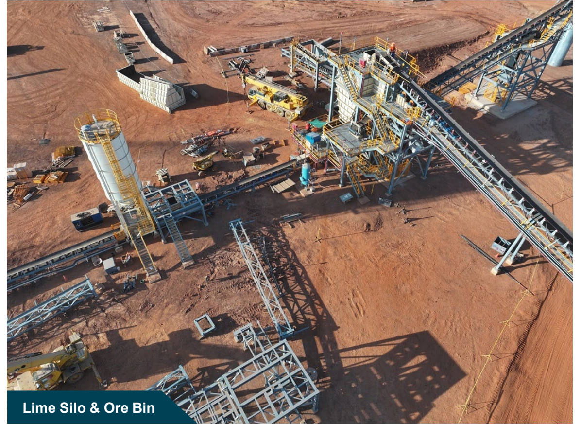
Lime Silo & Ore Bin