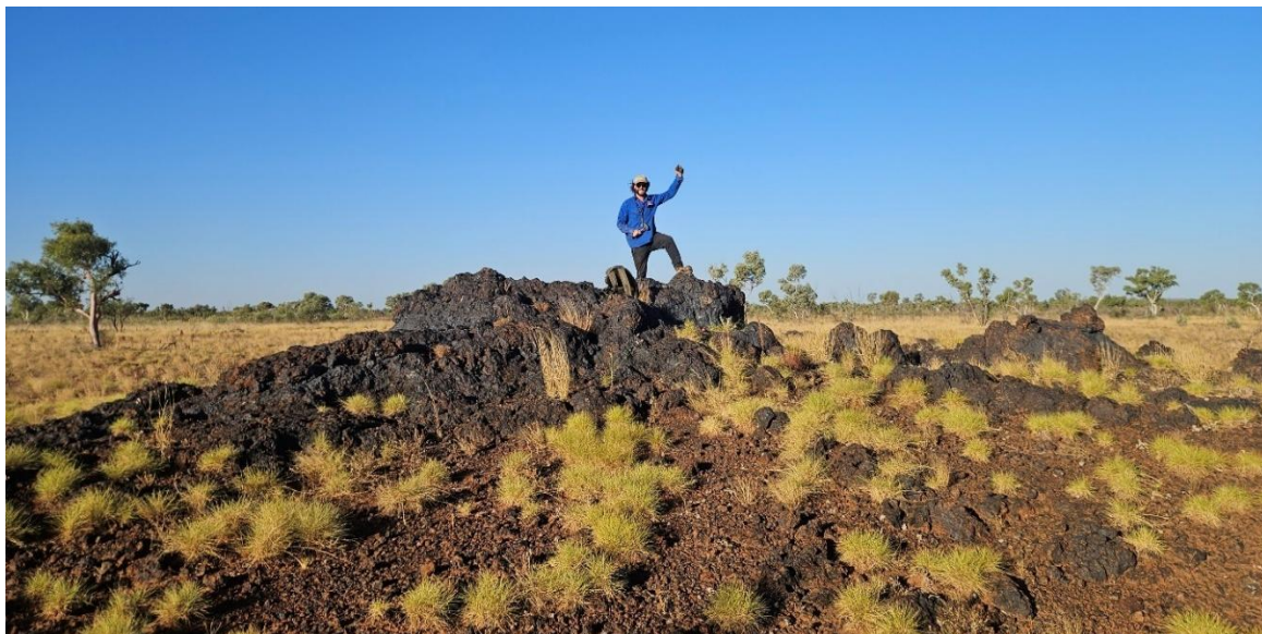
Figure 1. Trek Metals geologist atop the high-grade manganese discovery outcrop at Christmas Creek.