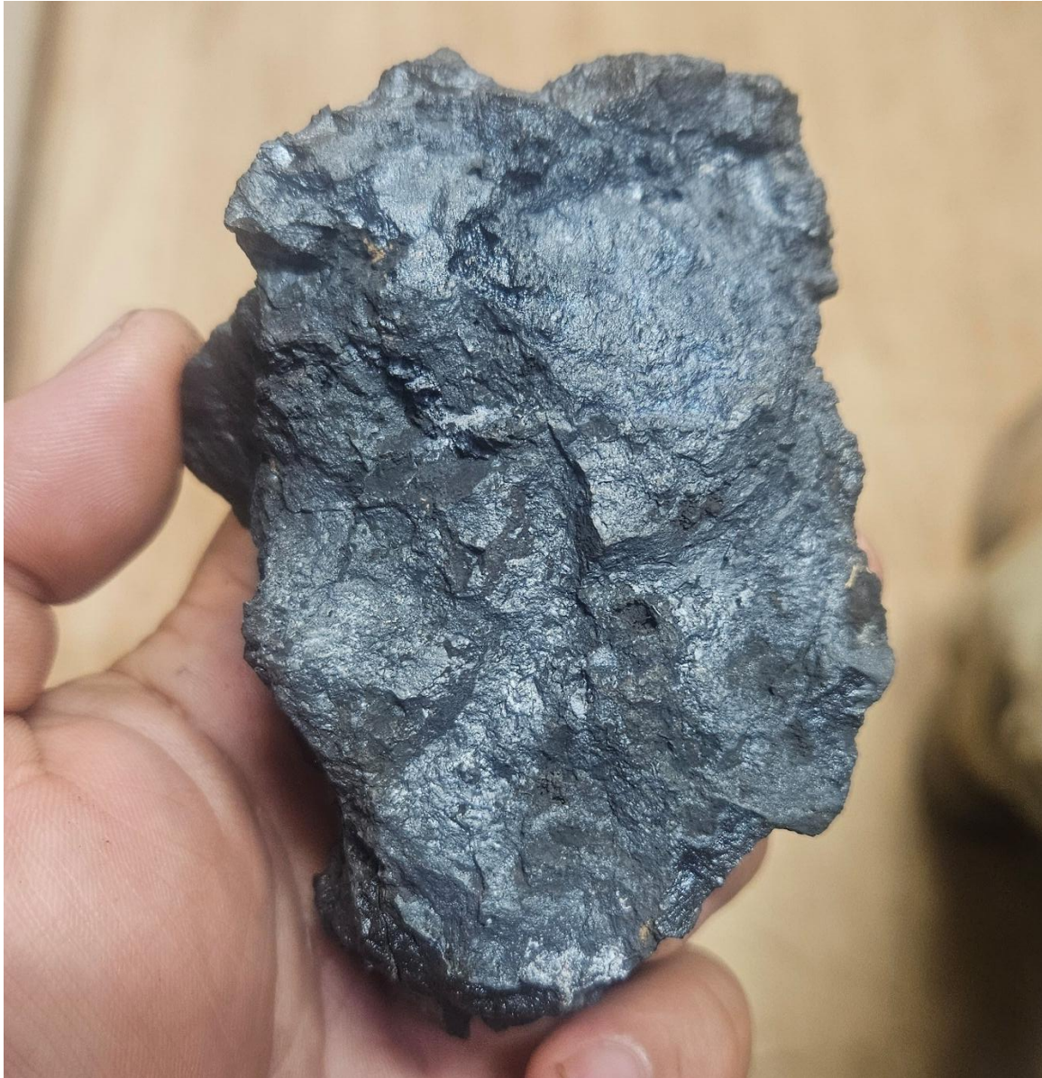
Figure 2. High-grade manganese rock chip sample example with 58.37 % Mn (sample ID TKMCCR2506) interpreted to represent near endmember pyrolusite, a high-grade manganese oxide.

The Company has received assays from recent rock chipping undertaken at a recently discovered cluster of very high-grade manganese outcrops (Figure 2 and Figure 3), returning exceptionally high manganese grades which have confirmed the commercial potential and significance of the find.