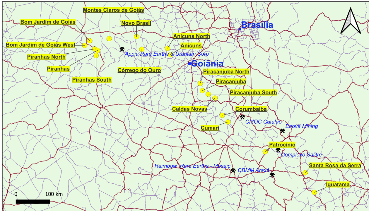
Figure 3 - REE prospects identified on Magnum's Az125 REE Project (yellow dots). The local road network provides easy access to these prospects. The area hosts notable REE deposits. Note proximity to the city of Brasília.

Two motorised auger rigs with three-man crews are being used (Figure 4). These rigs will sample from surface to a nominal depth of five metres. Samples are being collected every half a metre and will be dispatched to ALS laboratories in Brazil for assaying. The upcoming exploration work has been planned and managed by Magnum's Brazil based exploration team (led by Antonio Vitor, a significant Magnum shareholder), who have a track record of REE discovery in the area.