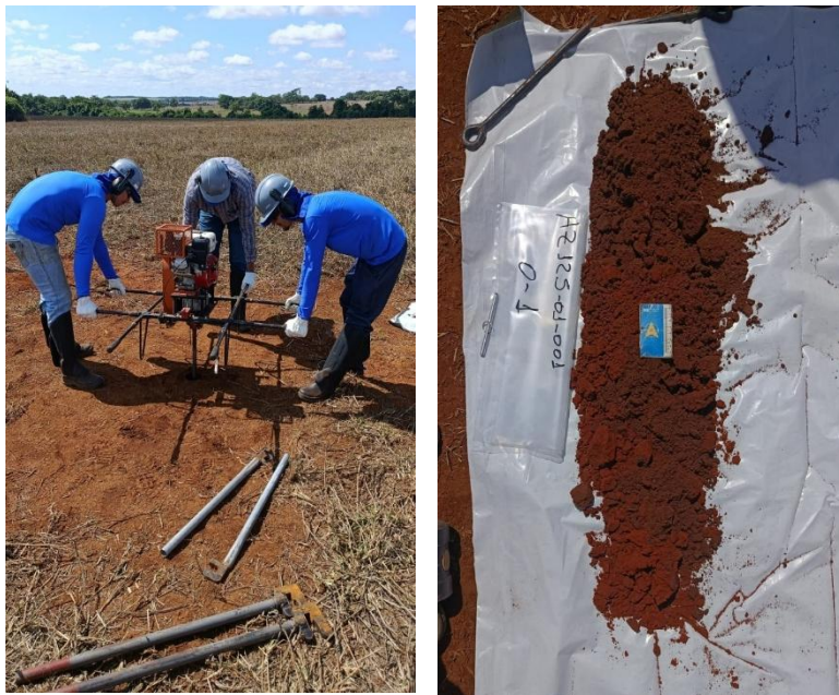
Figure 4 - Auger drilling is being undertaken by two three-man crews. Samples are collected at each 0.5m interval to a nominal depth of five metres at each site. Assaying will be done by ALS, Brazil.