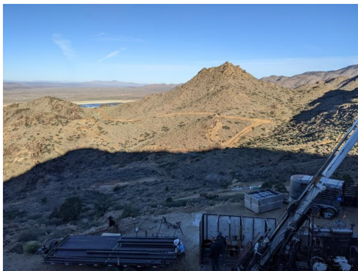
Figure 1 - Core Drilling at Golconda November 2025. Mineral Park in background.

"Arizona is a premier mining jurisdiction with a long and significant mining pedigree. Phoenix headquartered Freeport-McMoRan dominates copper production in Arizona with major diversified miners including BHP, Rio Tinto and South 32 all having significant development projects in the State."