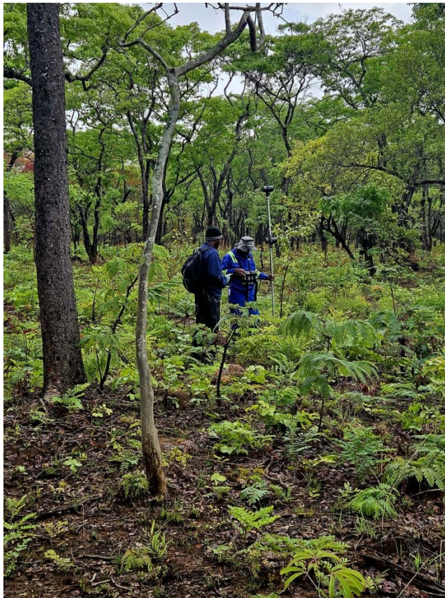
Figure 3: Ground magnetics survey in progress, with I.P. to follow at Target B1

The host rocks are sandstone and mudstone with intercalations of shale and quartzite. The contacts are limonitic, carbonated, brecciated and shows visible copper minerals (malachite, chrysocolla and chalcopyrite) in some parts. The results indicate a zoned strata bound epigenetic polymetallic deposit model with a copper core and zinc and lead on the outward ring. A 30-hectare ground magnetics and I.P. survey is underway to help in mapping lithologies and structural zones. I.P. survey will be crucial in detecting subsurface disseminated sulphides. A Phase 2 trenching program will commence after completion of geophysical surveys.