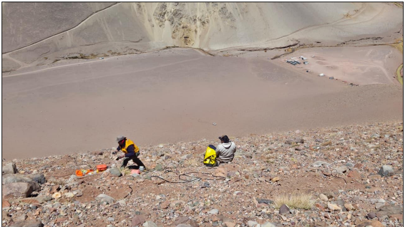
Figure 3: Quantec technicians laying out the MT/IP survey lines across the Toro targets. Note the TMT Camp in the top right corner for scale.