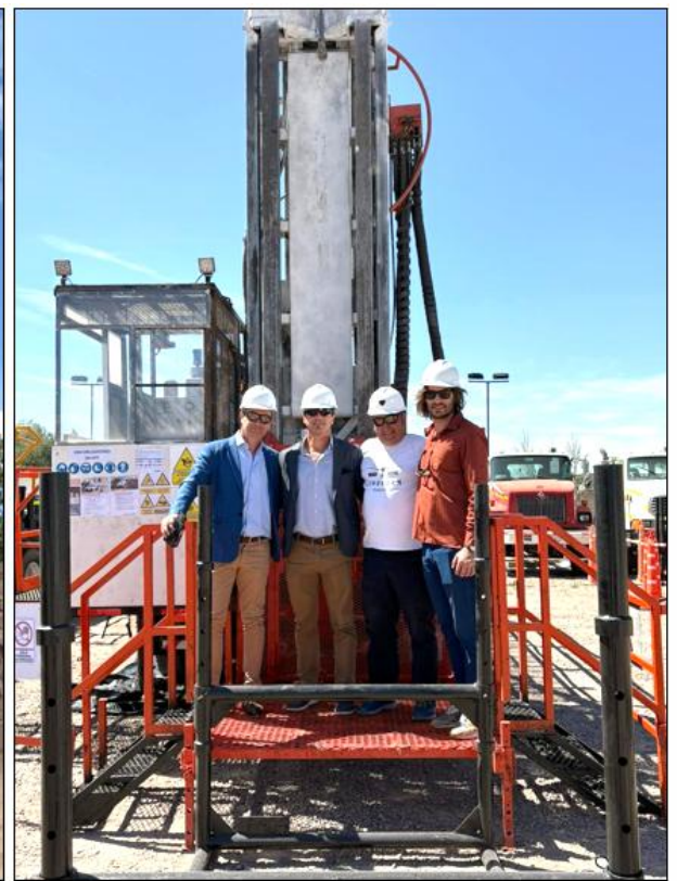
Figure 1: Left image shows Boart Longyear' deep hole drill LF230 ( https://www.boartlongyear.com/product/lf230/ ). Right image shows GWK S.A. (100% subsidiary of Belararox Ltd.) personnel inspecting the LF230 on Boart Longyear's drilling yard, earmarked to mobilise to the TMT site within the coming fortnight.