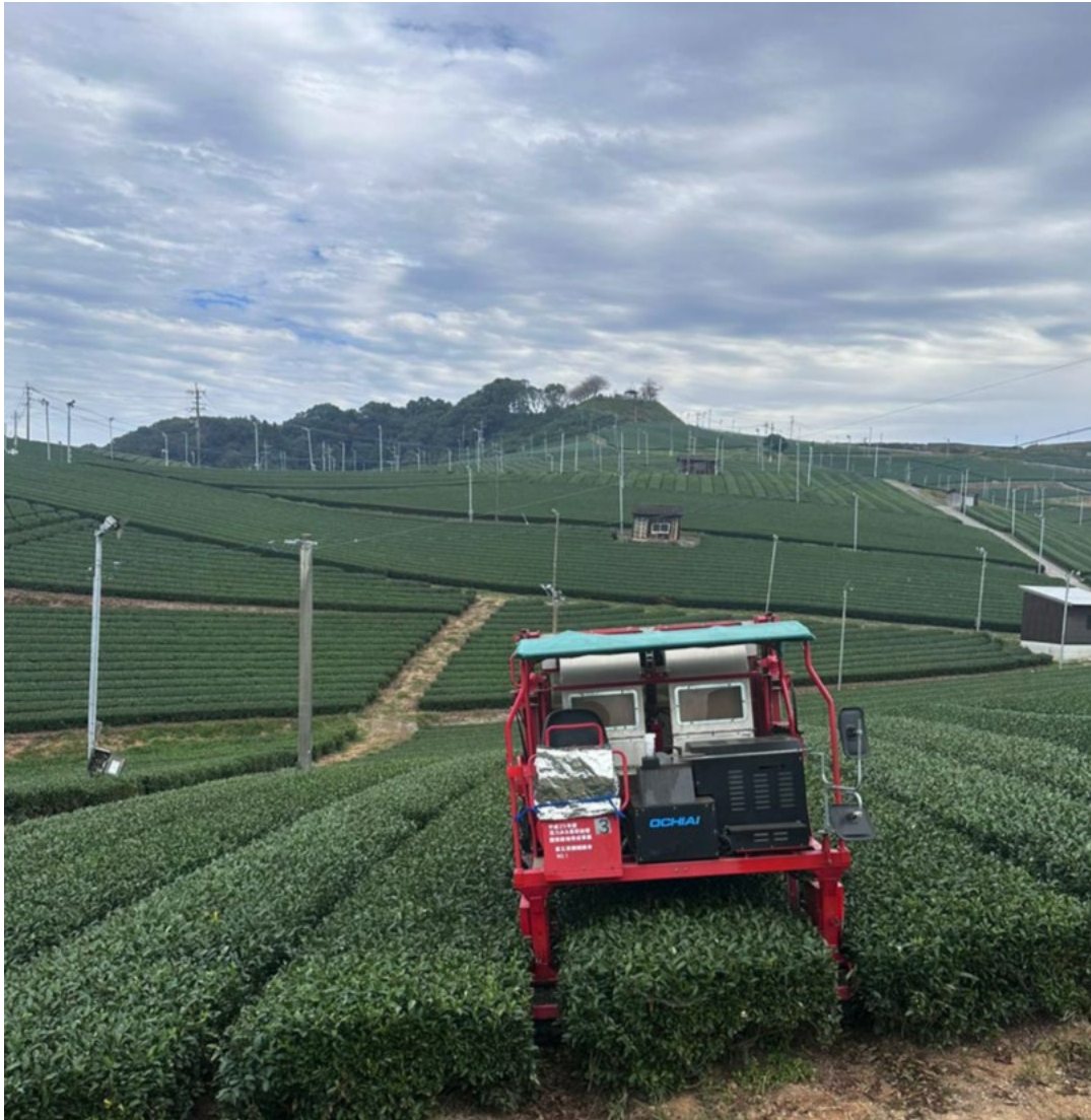
Image: SANDAI's farm and operations in Nagasaki, Japan