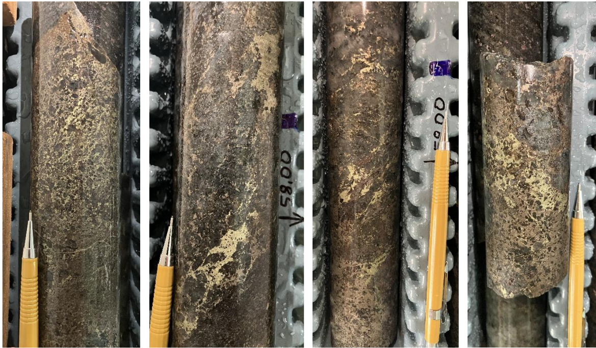
Figure 4: Mineralised intervals at Touro Prospect. From left to right: PDT-117 from 56.75m downhole, PDT-117 from 57m downhole, PDT-117 from 58m downhole and PDT-117 from 64.2m downhole. Dark brown mineral is sphalerite (zinc sulphide), golden colour is chalcopyrite (copper sulphide), pale yellow is pyrite (iron sulphide) and bronze colour is pyrrhotite (iron sulphide).

Cautionary statement: Visual estimates of mineral abundance should never be considered a proxy or substitute for laboratory analyses where concentrations or grades are the factor of principal economic interest. Visual estimate logs are subjective in nature and potentially provide no information regarding impurities or deleterious physical properties relevant to valuations. Portable XRF is used as an aid in the determination of mineral type and abundance during the geological logging process. Laboratory assays are expected in 6-8 weeks.