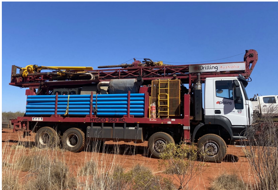
Figure 1: RC drill rig at Wagyu Gold Project

New Age Exploration (ASX: NAE) (NAE or the Company) is pleased to advise that a Reverse Circulation (RC) drill rig has mobilised to the Wagyu Gold Project (Figure 1) and is set to commence drilling later today. This will mark the start of the previously announced ~4,000m program targeting strike and depth extensions to known 'Hemi Style' gold mineralisation and testing of newly defined zones. (Refer to ASX Announcement 6 November 2025 .)