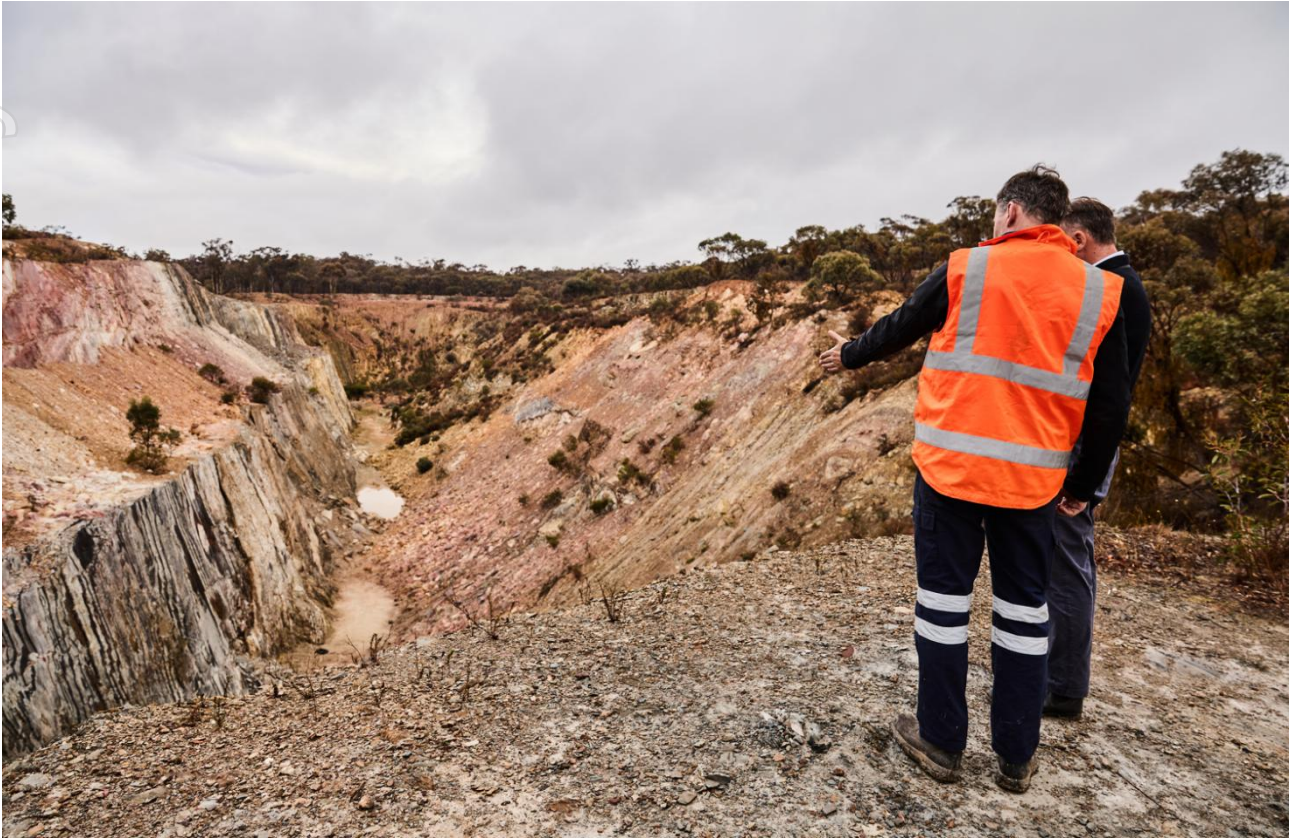
Figure 6 – Aureka team surveys the Comstock pit at St Arnaud.

This announcement has been approved for release by the Board of Directors.