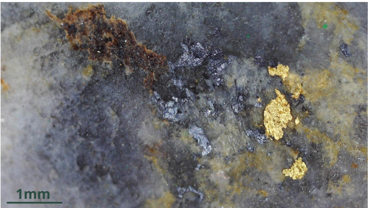
Figure 1: St Arnaud Comstock visible gold, galena and sphalerite (25NED002)