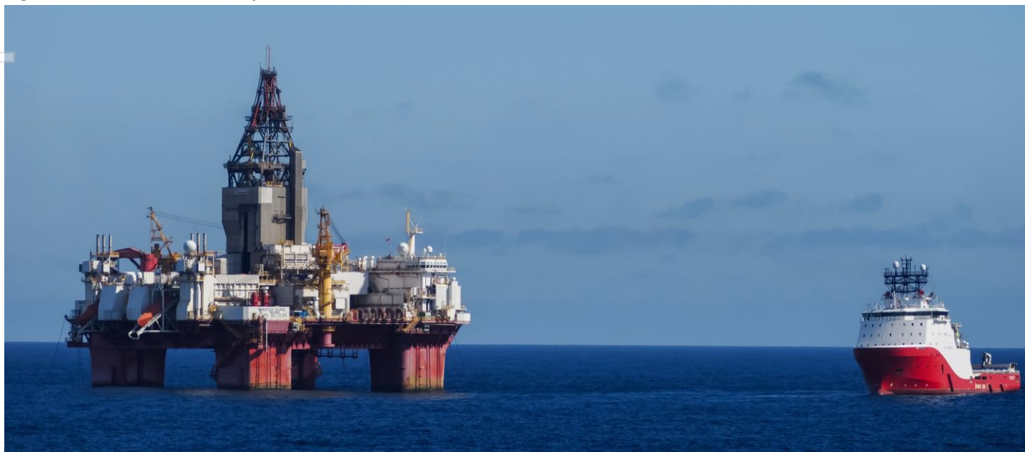
Figure 1 – The Transocean Equinox with the Sea 1 vessel Emerald.