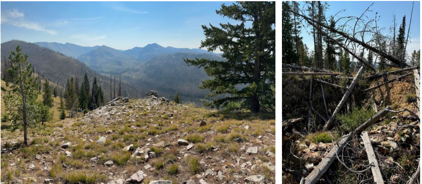
Figure 3: (LEFT) Landscape of the Red Mountain Yellow Pine Antimony Project.

Field mapping by RMX's field crew has confirmed the presence of tectonic breccias within quartzite associated with the main NNE-trending fault (Figure 2), indicating that hydrothermal fluid circulation occurred along the structure - a positive indicator for potential mineralisation. Red Mountain geologists have successfully located the two eastern historical workings mapped by the Idaho Geological Survey, which are small shallow pits targeting brecciated quartz veins prospective for gold and/or antimony (Figure 3).