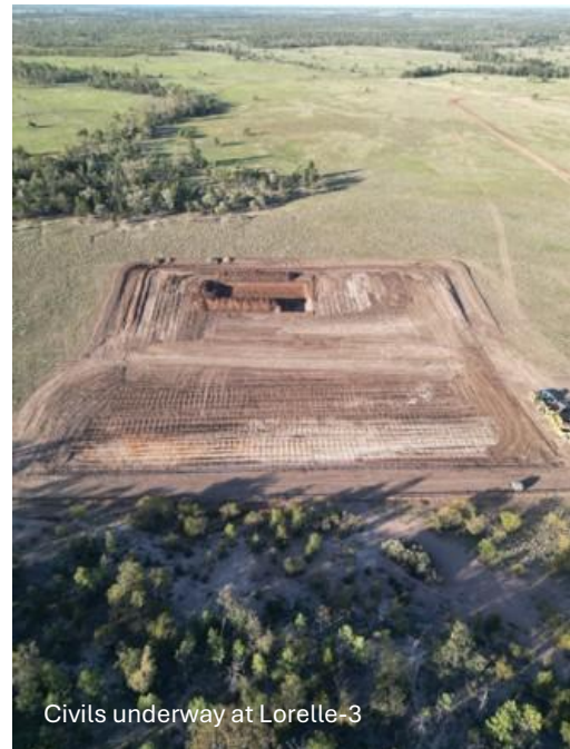
Civils underway at Lorelle-3

Civils, site preparation and well pad construction is underway and is 30% complete. All other long lead items have been secured, and the rig is expected to depart for the Lorelle-3 well site commencing mobilization and rig up on the 12 th of January 2026, with the spud of the well expected to occur shortly after that time.