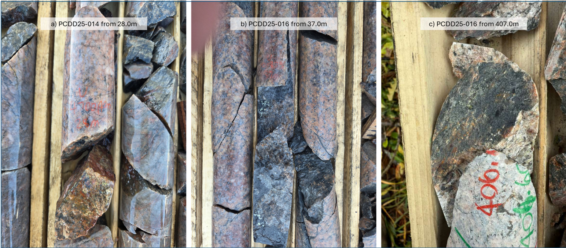
Figure 4: Drill core from PCDD25-014 (470462E, 5558025N, UTM Zone 21) and PCDD25-016 (470515E, 5558036N, UTM Zone 21) demonstrating significant mineralisation of Zn, Cu and Mo in fractures.