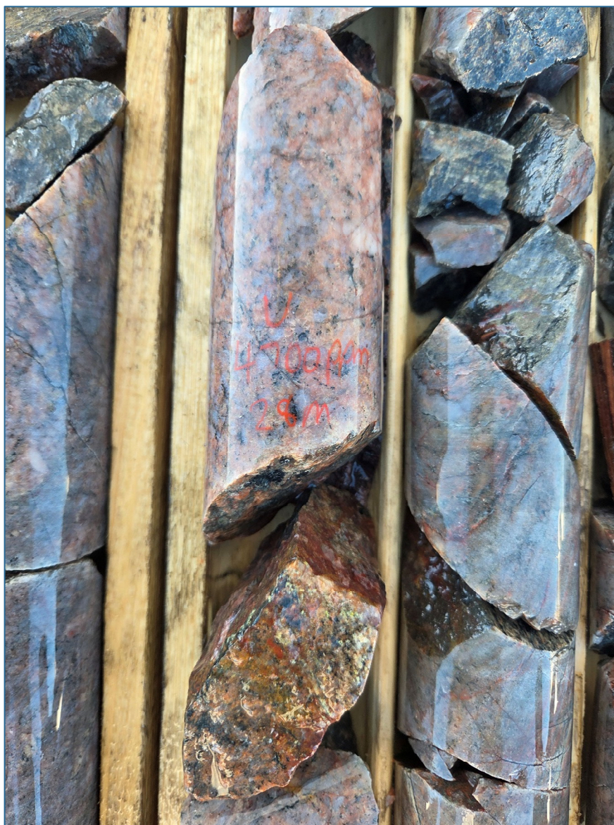
Figure 1: Visible uranium observed in PCDD25-014 (470462E, 5558025N, UTM Zone 21) at a drillhole depth of 28.0m.