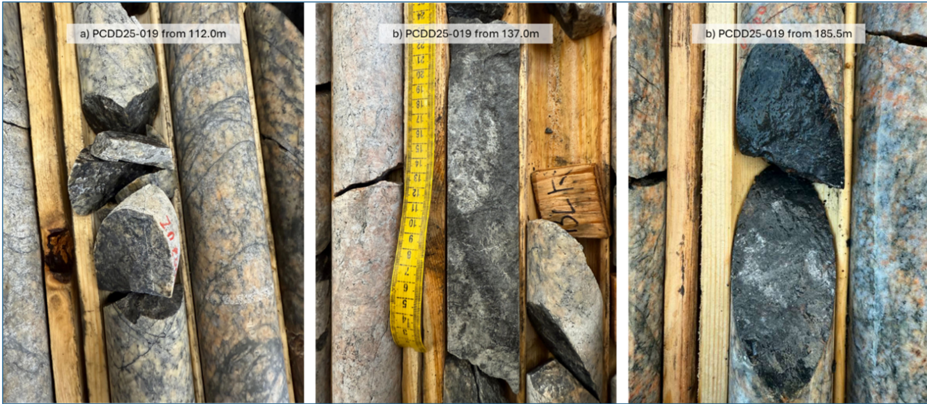
Figure 5: Drill core from PCDD25-019 (470813E, 5558967N, UTM Zone 21) demonstrating significant mineralisation of Zn, Cu and Mo in fractures.

a) From 112.0m showing up to 8,000 ppm Zn with pXRF 1 .