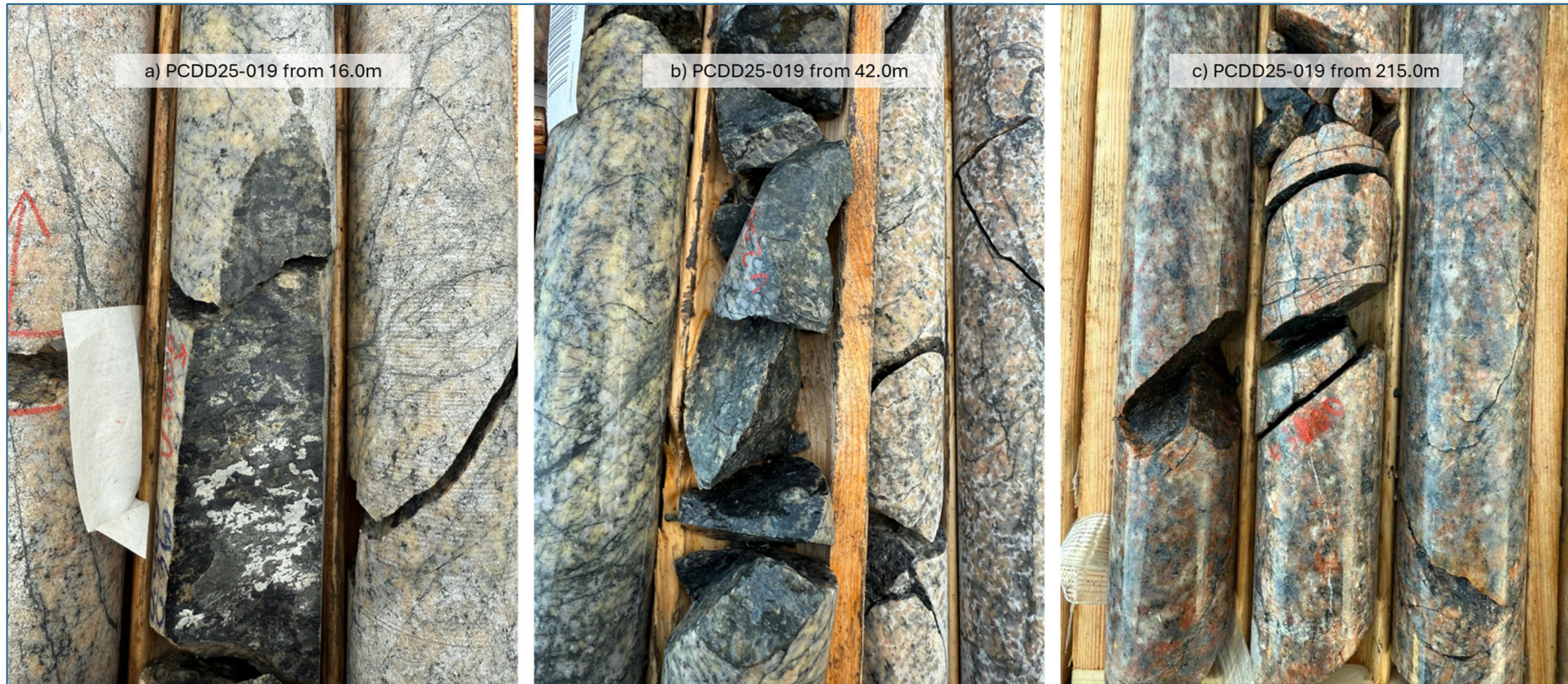
Figure 3: Drill core from PCDD25-019 (470813E, 5558967N, UTM Zone 21) demonstrating uraninite mineralisation in fractures.