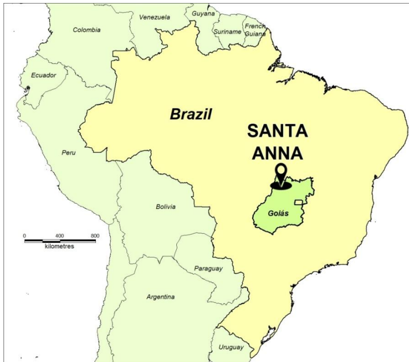
Figure 2. Location of the Sana Anna Project within the Goiás State, central Brazil.