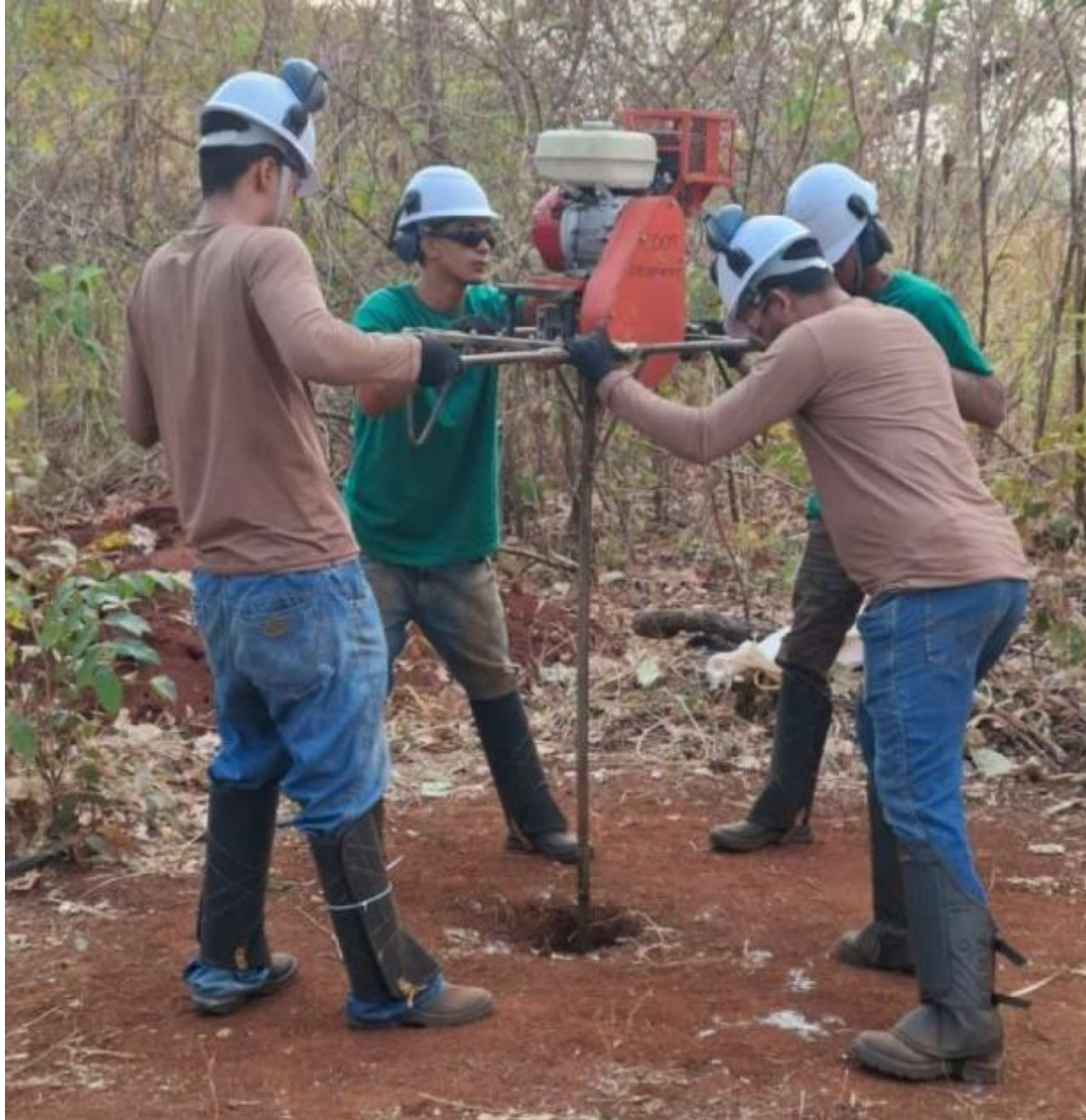
Figure 4. Drilling of auger hole MN-TM-005.