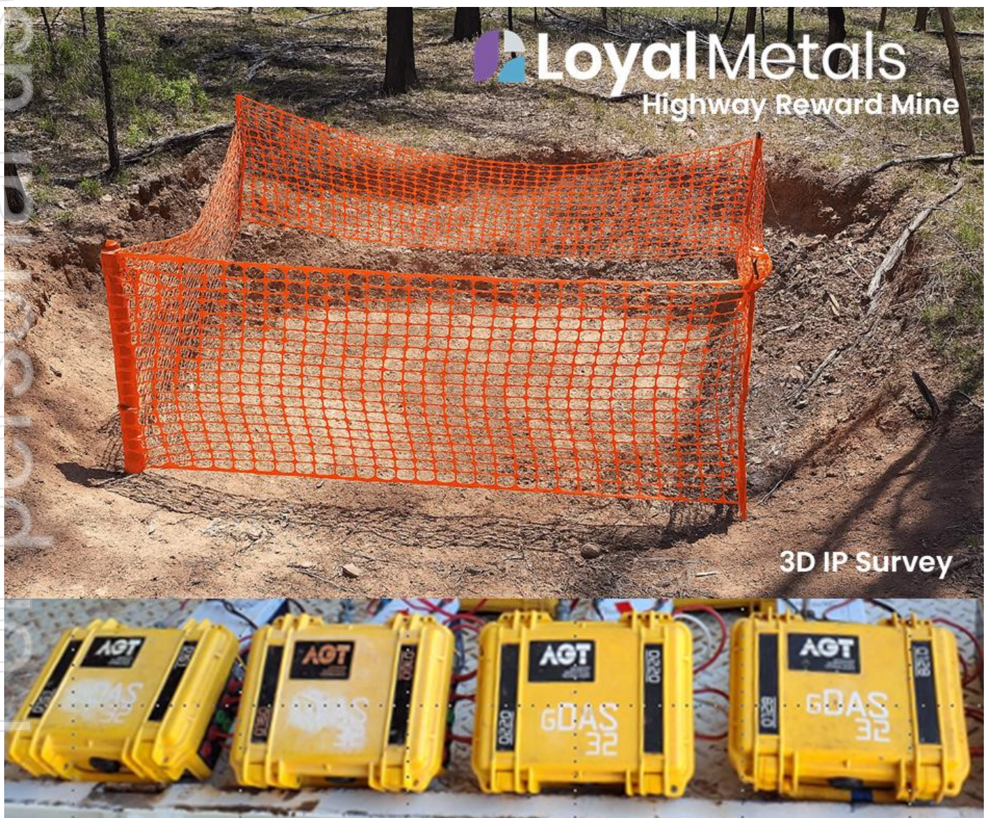
Figure 2: Highway Reward Copper Gold Mine: In field deployment of the 3D IP Survey equipment.

"The launch of our full-suite geophysical program is essential to unlocking Highway Reward's untapped potential. The very first drill hole in more than 20 years has already uncovered a new near-surface discovery zone containing zinc, copper and gold minerals – clear evidence that significant mineralisation remains both within and beyond the historic workings. That immediate success justifies expanding geophysical coverage across the leases, at depth and along trend. By integrating high-resolution ground-based and drone geophysics with advanced analytics in the VRIFY DORA platform, we are sharpening our targeting for the 2026 drilling campaign and building long-term value through disciplined, modern exploration."