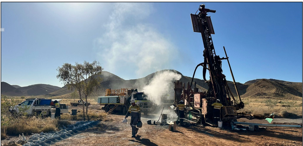
Figure 1. RC drilling underway at Top Camp – Croydon Gold Project