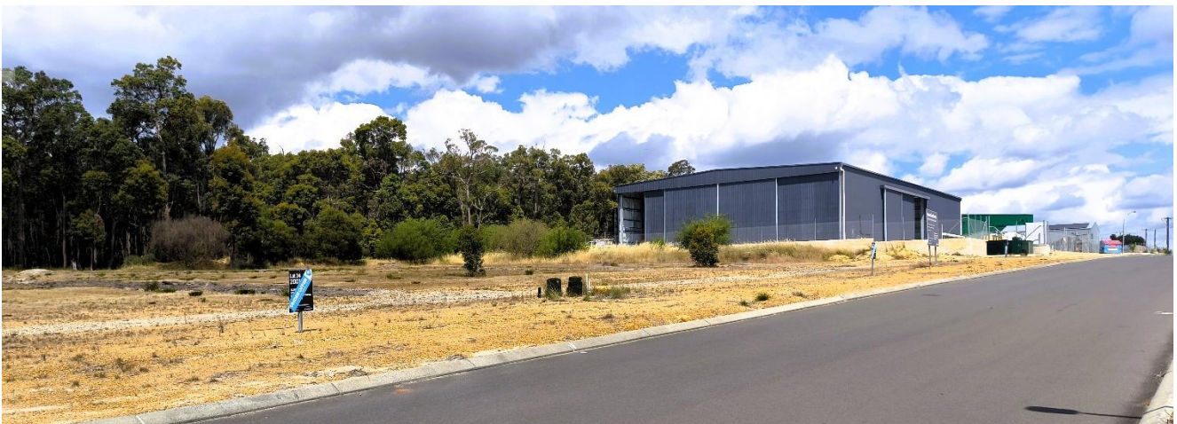
Figure 1 (top left): R&D Facility. Figure 2 (top right): Plant locations. Figure 3: New lots in the Collie LIA.