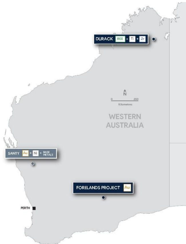
BPM Minerals Western Australian Projects

The management and exploration teams are well supported by an experienced Board of Directors who have a strong record of funding and undertaking exploration activities which have resulted in the discovery of globally significant deposits both locally and internationally.