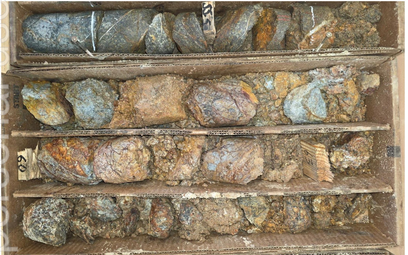
Figure 2: DD25TT001 core showing strongly weathered quartz breccia vein with iron oxide staining, interpreted as fault-hosted mineralisation beneath a gabbro dyke. Visual observations only; sampling and assays are pending. All measurements within core boxes are in Imperial.

DD25TT001 targeted this same zone to obtain metallurgical samples, validate continuity and significantly improve QA/QC standards to strengthen confidence in resource modelling. The hole intersected approximately 7 ft (2.1m) of strongly weathered quartz breccia vein hosted within the fault zone beneath the gabbro dyke. These observations are visual only and do not confirm grade; assays are pending.