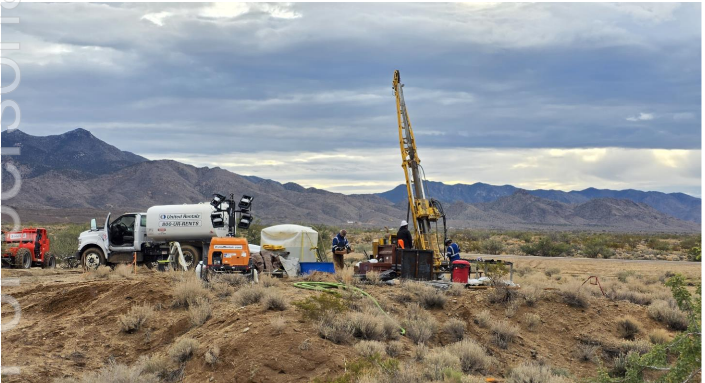
Figure 1: Diamond drill rig at hole DD25TT001 at the Kingman Gold Project, Chloride, Arizona.

The JORC Mineral Resource comprises high-grade, very shallow oxide from outcrop to 40m and is open in several directions, including to the northwest, where drilling will target extensions.