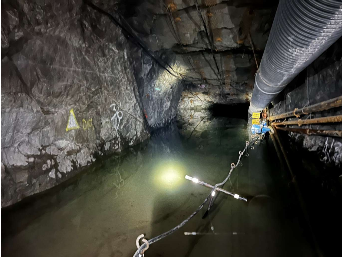
Figure 2: Dewatering continues, with XC4 in background, as denoted by cut out on the left, and the yellow signage to the Mine Refuge chamber next to services on the right. Photo taken 27th November 2025.

The drill program will have two objectives: