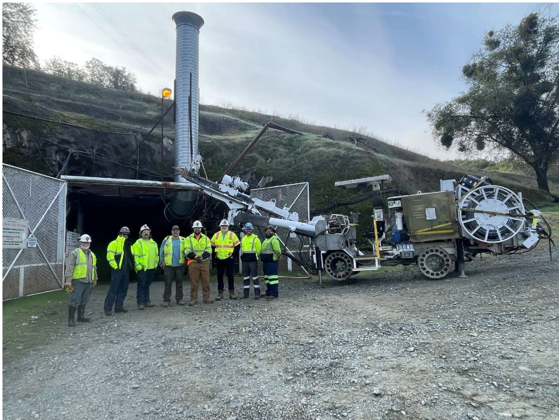
Figure 1: Swick and Company personnel with Gen II underground Diamond drill at portal entrance at Stringbean Alley Decline

The Swick Gen II diamond drill rig arrived on site at the Lincoln Gold Project on the 27 th November 2025 (refer to Figure 1). The planned drill programme is slightly modified from that previously announced 4 and now comprises 25 HQ-sized diamond drillholes totalling ~2,600m, with flexibility to add additional holes. The contracted drilling program is for 1,700-3,000m, with flexibility to expand the project (subject to board approval).