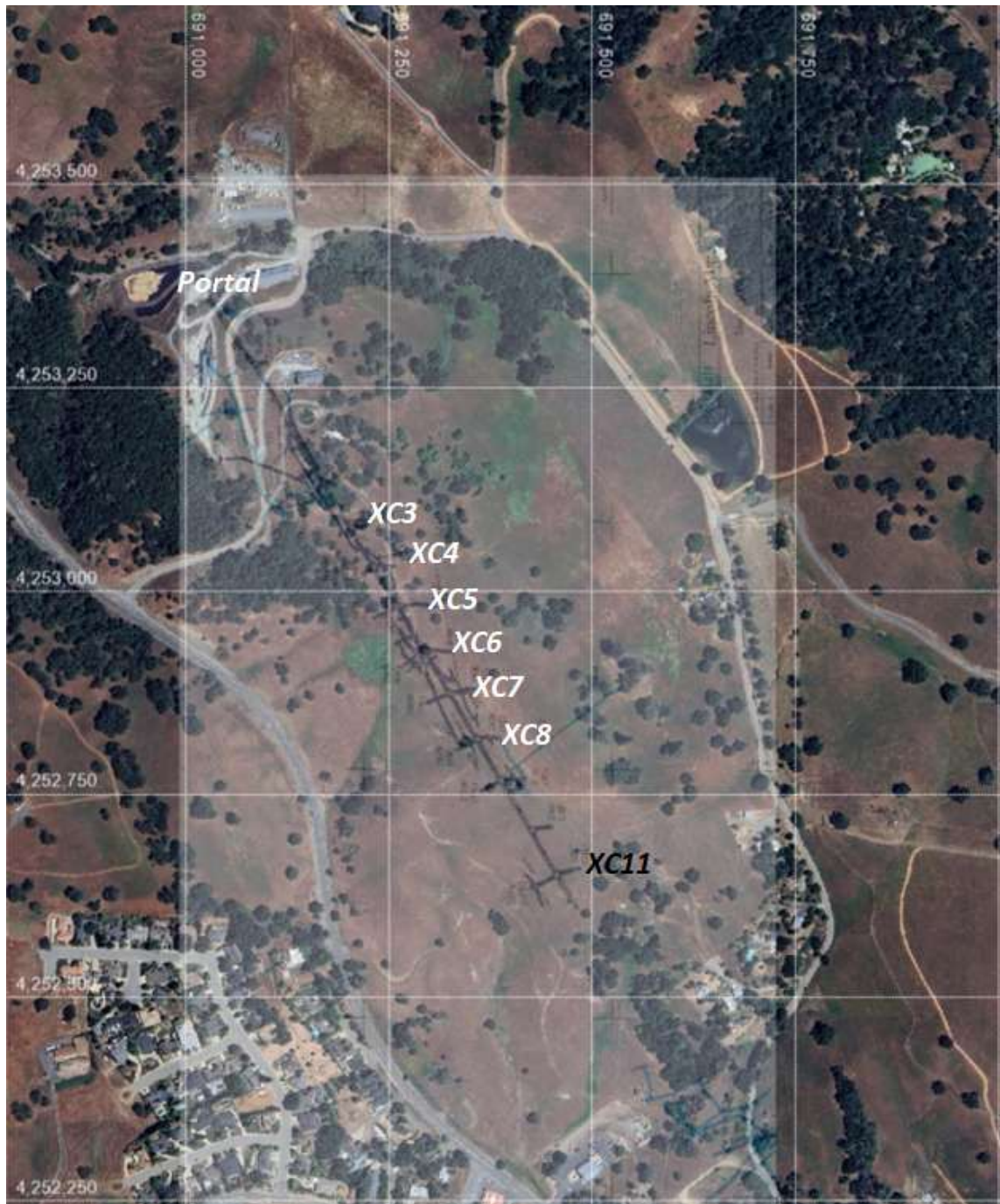
Figure 3: Aerial View on southern portion of Lincoln gold project showing location of Stringbean Alley Decline and Crosscut Locations for drilling in white.

Dewatering is typically continuing at or marginally below the maximum permitted rate of 58,000 gallons (220 metric tonnes) per day. Under site permitting the Company cannot discharge during significant rain events, and until 24 hours after the conclusion of rain events greater than half an inch (12mm). Earlier this month the site received an unseasonal 6 ½ inches (165mm) of rain over 6 days, which