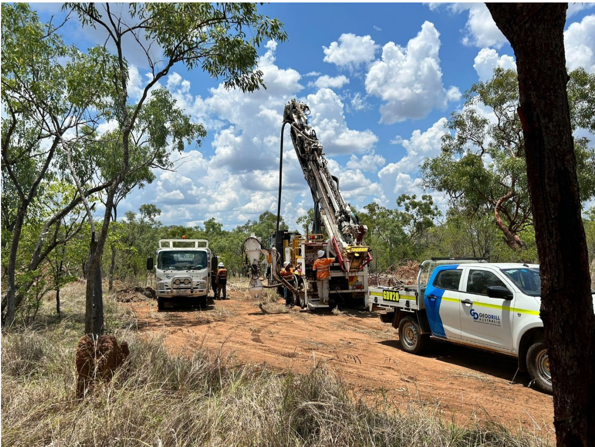
Photo 1: Drill Rig Setting up at the first drill pad (P1002) at the Fiery Creek Prospect

Emu NL announces the commencement of drilling with support vehicles and drill rig arriving Friday to set-up on the first drill pad (P1002) at the Fiery Creek prospect (Photo 1).