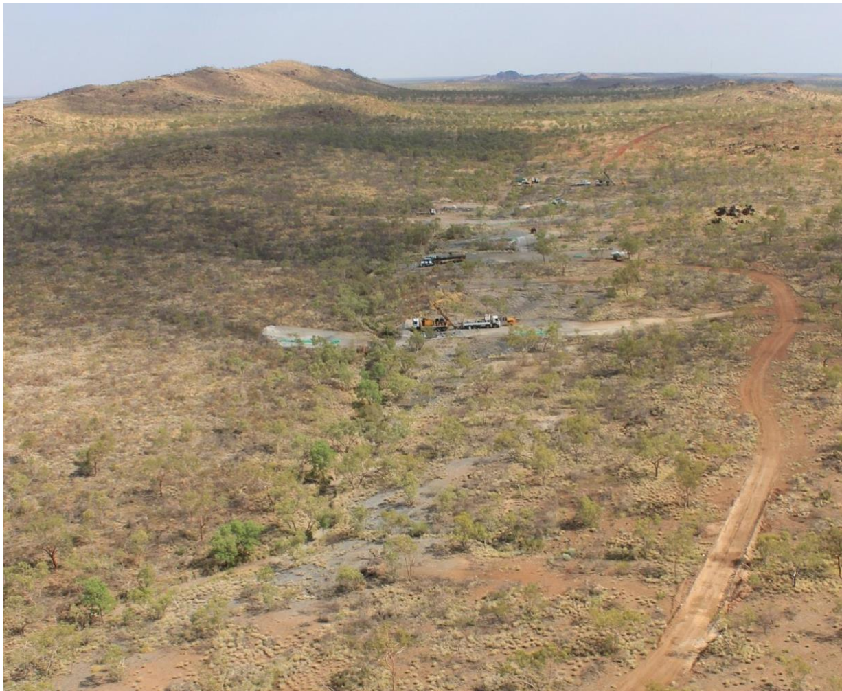
Figure 3: Aerial view looking north of Mt Dromedary Tenements with Burke Tenement to the west (2015)