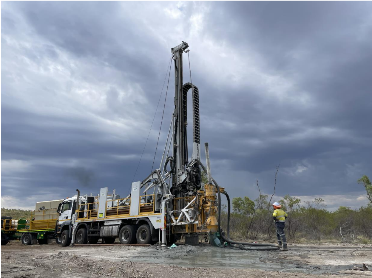
Figure 2: Drill rig set up on first RC drill hole at the Burke Graphite Project (Nov 2025)

The +14% TGC average grades of the Burke and Mt Dromedary Deposits are significantly higher than most global peers, with potential for resource expansion as graphite mineralisation is open to the north and south and in between the currently defined Mt Dromedary and Burke Deposits.