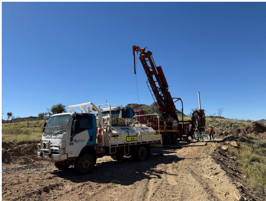
Figure 2: GeoDrill reverse circulation drill rig at Harts Range