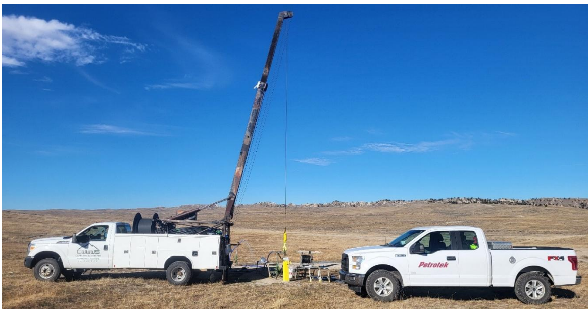
FIGURE 1: FIGURE 1: PETROTEK AND WYOMING WATER SERVICES CONDUCTING HYDROGEOLOGIC TESTING AT LO HERMA, POWDER RIVER BASIN, WYOMING

The testing progressed efficiently and successfully, with all wells demonstrating sustained flow rates with minimal aquifer drawdown for the full duration of the tests. These results present an important step in confirming aquifer transmissivity and supporting the project's ISR development pathway. The Company anticipates receiving Petrotek's comprehensive pump testing results and analysis before the end of the year.