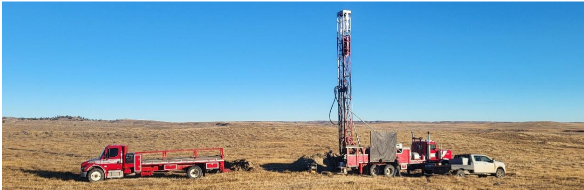
FIGURE 2: DRILL RIG IN OPERATION NORTH OF PROPOSED MINE UNIT 2, LO HERMA ISR URANIUM PROJECT, SOUTHERN POWDER RIVER BASIN, WYOMING

The ongoing drilling program is designed to expand the existing resource base and improve geological confidence ahead of the planned 2026 Mineral Resource Estimate update.