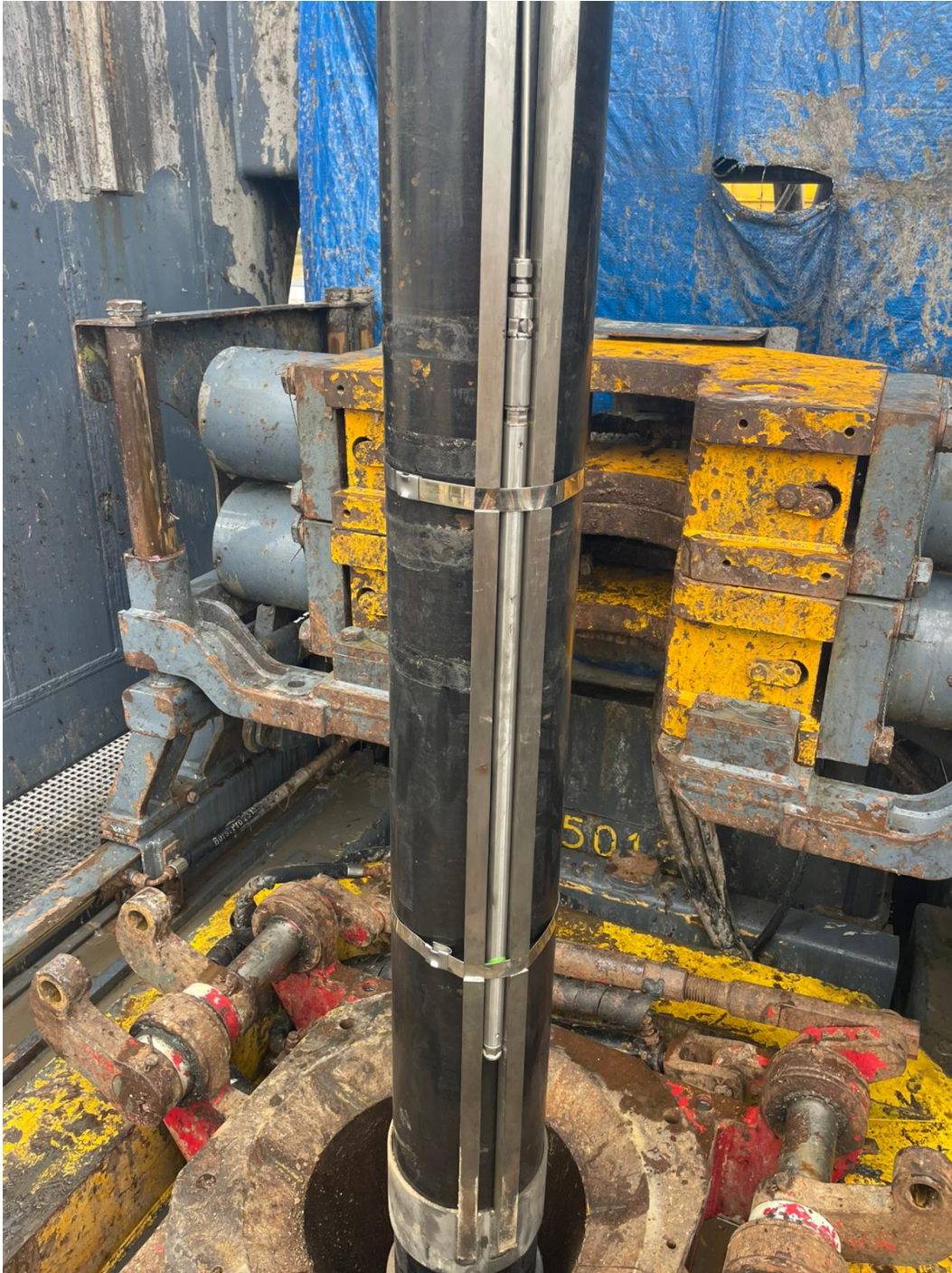
Image 3: Running production casing in Ramsay 3. Note the fiber optic cable attached to the outside of the casing for data collection.