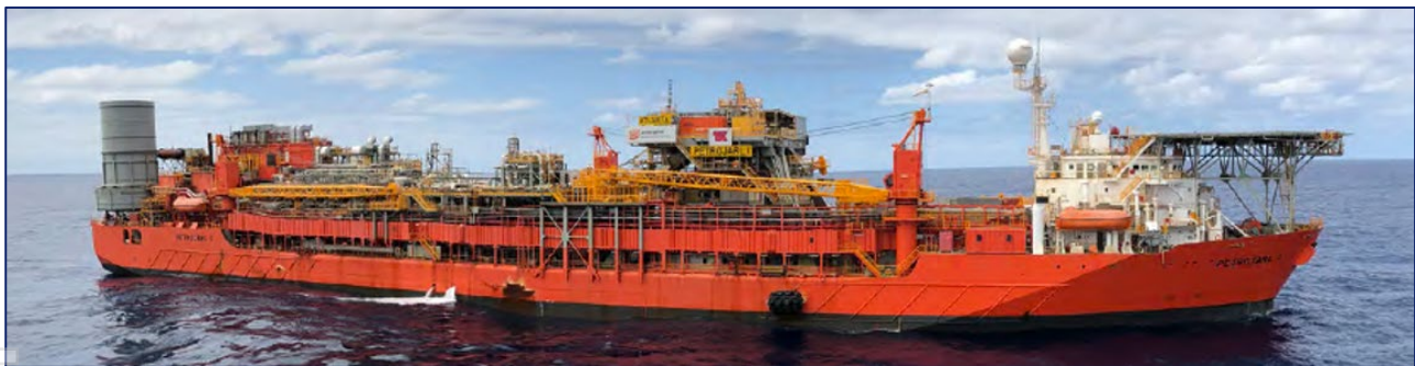
Figure 2 | PJI Specifications