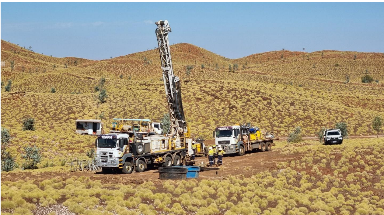
Figure 2. Terra Drilling has been contracted to commence a 650m diamond hole which is supported by a $110,930 grant from the WA Government's Exploration Incentive Scheme (EIS).