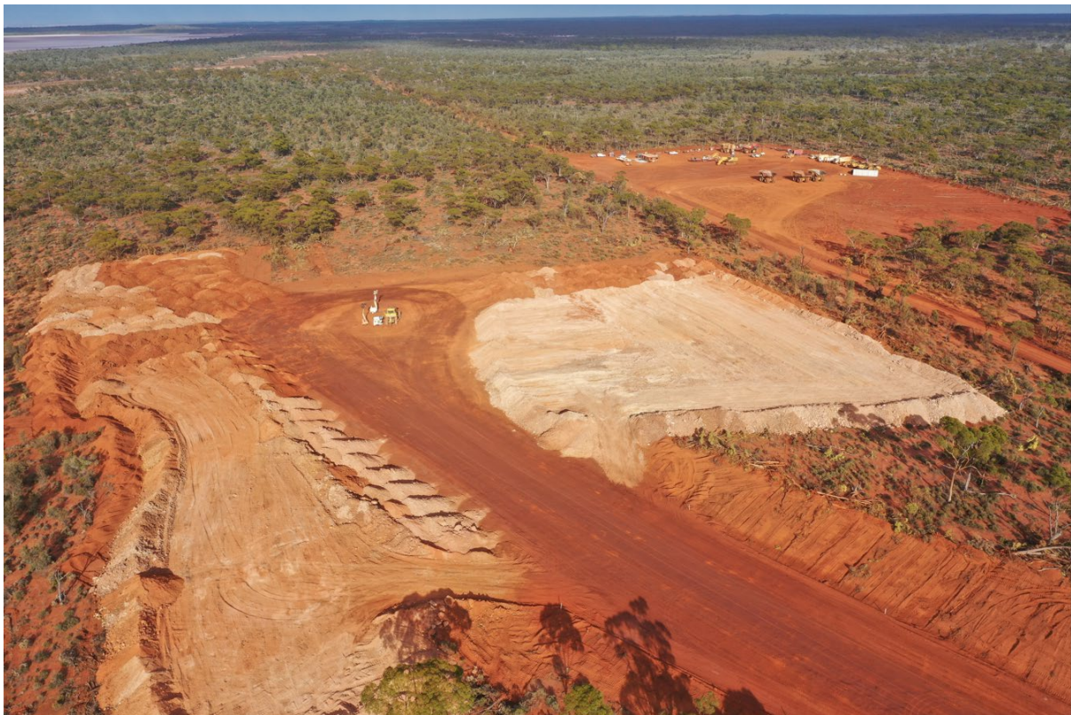
Figure 2: Location of Lucky Strike Waste Dump, ROM Pad and Site Offices (Looking to the North West)

“With an historically high gold price, there is no better time to be commencing a new gold mine. We are excited to be on track for production of first gold in February 2026”.