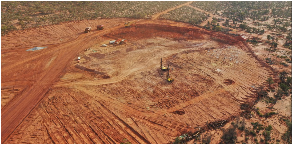
Figure 1: Pre-Strip activities - Lucky Strike Stage 1 Pit (Looking North East).