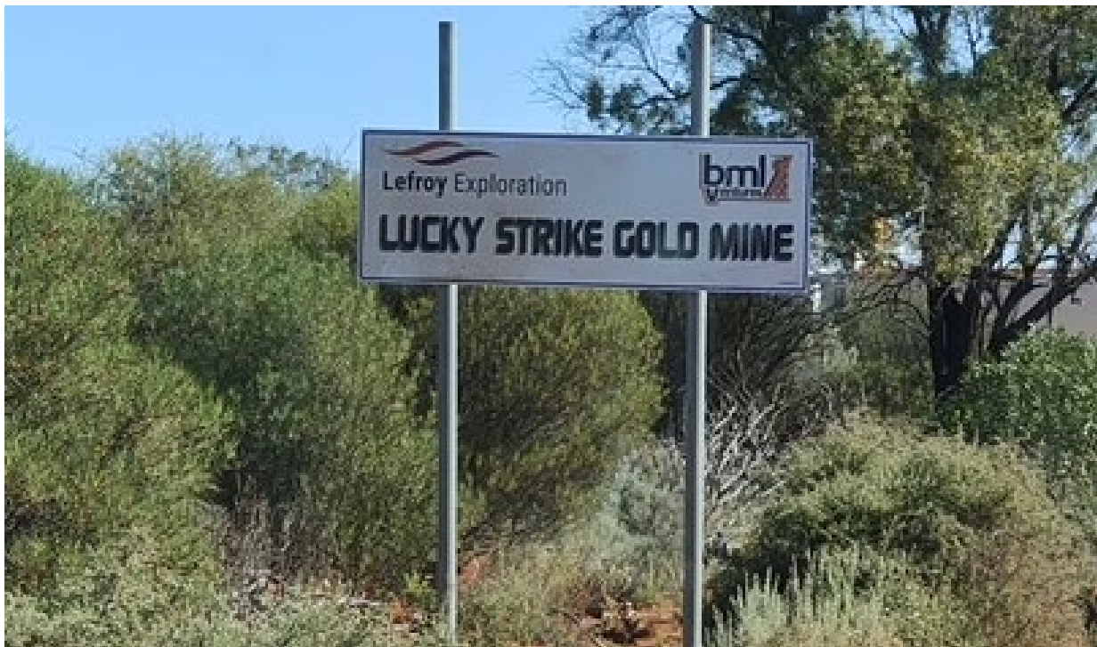
Figure 3: Lucky Strike Gold Mine – Western Access Point

In total, 21,560 BCMs of waste have been mined to date from the Lucky Strike Stage 1 pit. A view of the pit outline along with the expanding waste dump are shown in Figures 1 and 2.