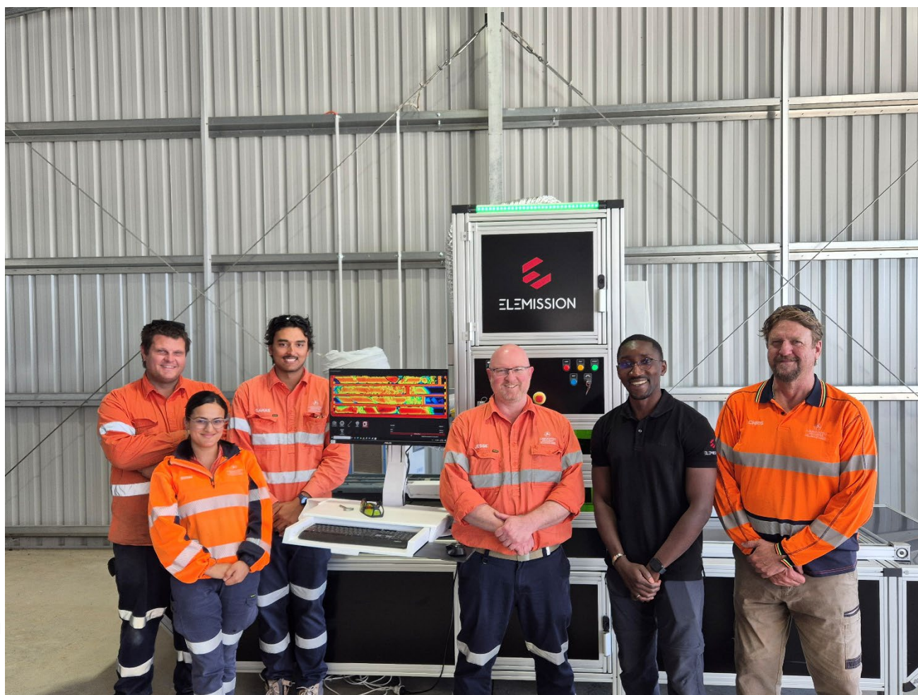
Figure 4 Hillgrove Geological team with ECORE Elemission technician

Visit www.larvottoresources.com for further information.