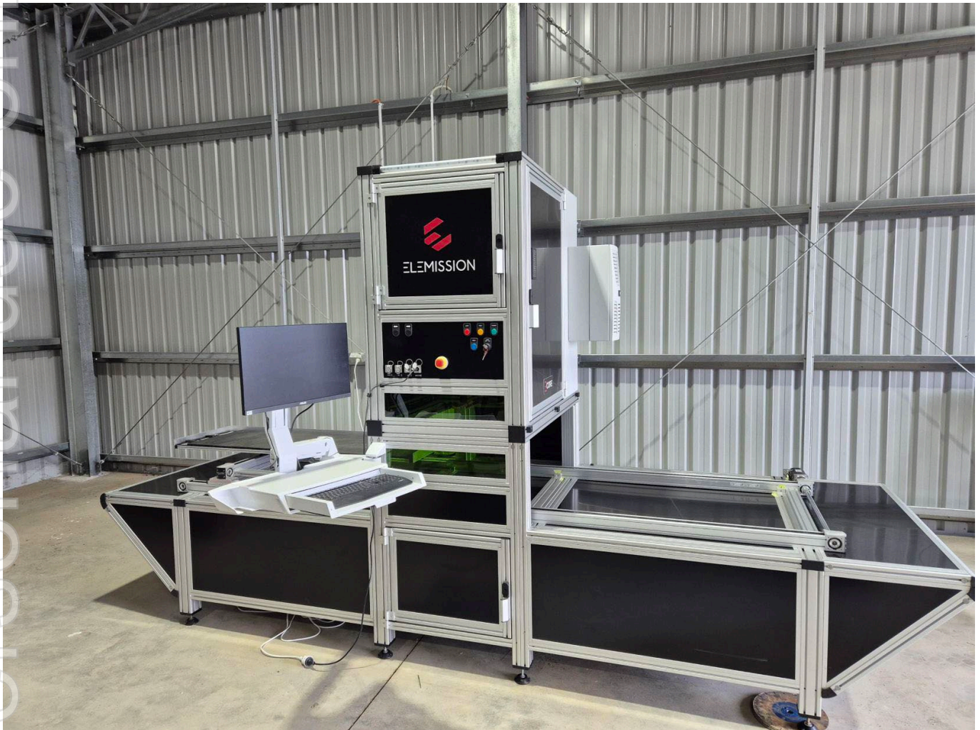
Figure 1 The ECORE core scanning system installed in the Larvotto exploration facility