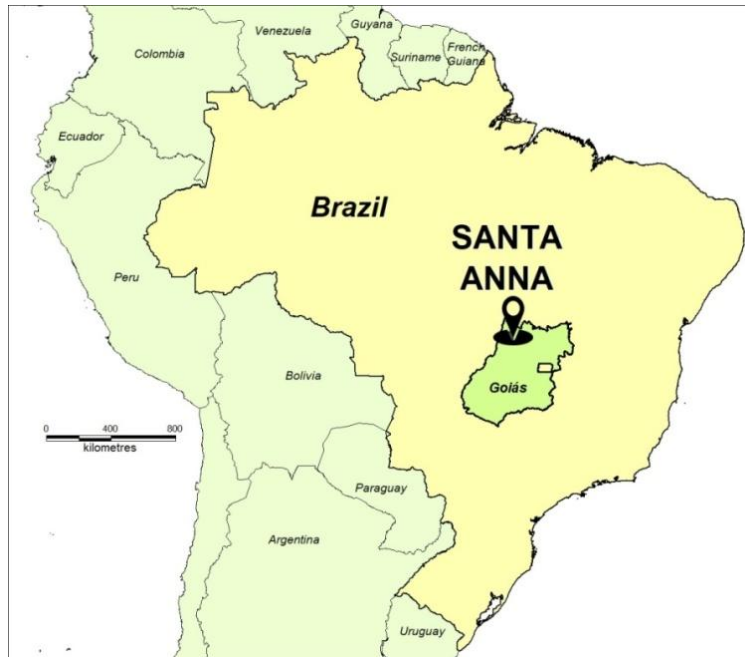
Figure 2. Location of the Sana Anna Project within the Goiás State, central Brazil.

Authorised for release by the Board of Power Minerals Limited.