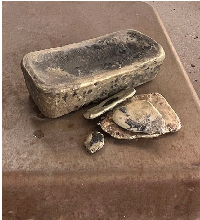
Figure 1: Doré poured at GGPP on 3 December 2025