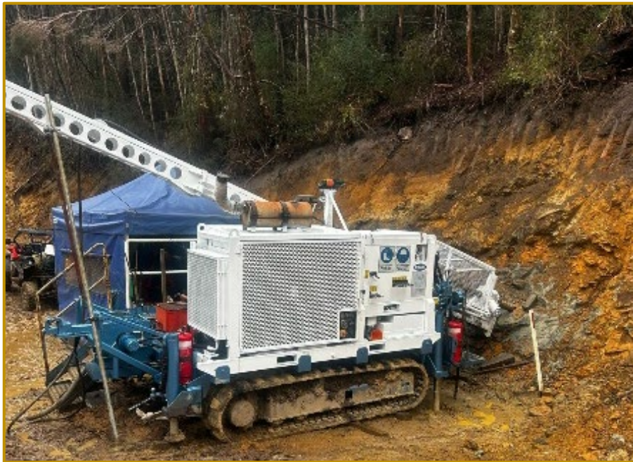
Figure 1. Diamond drill rig onsite at the Sweeneys Prospect in the Federation project, Western Tasmania.