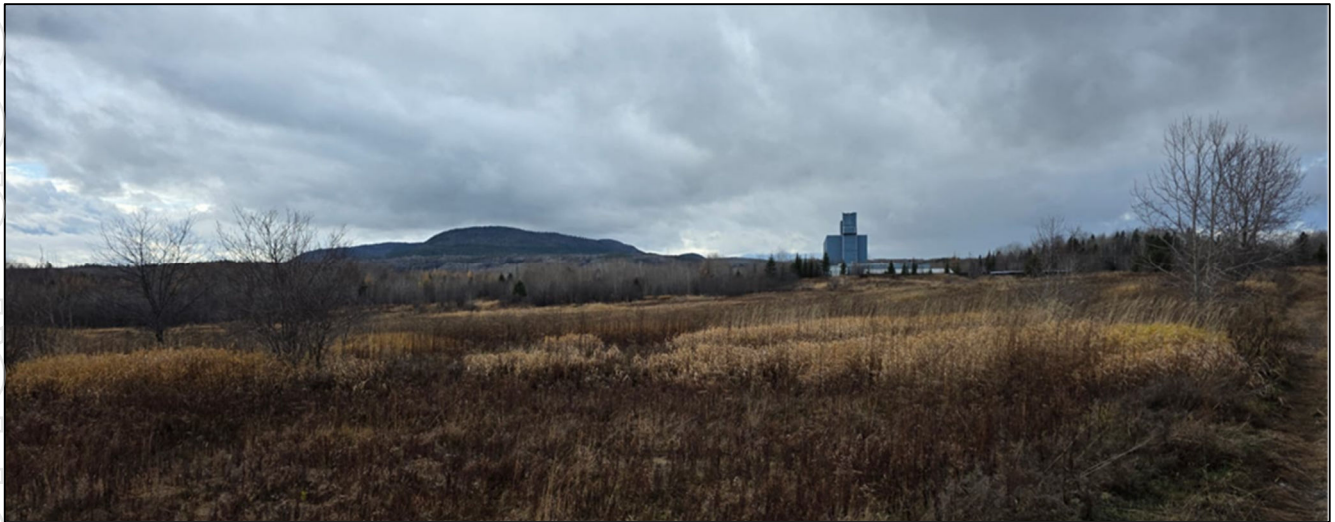
Figure 2 –Augmitto - Rouyn Gold Project

This announcement may contain some references to forecasts, estimates, assumptions and other forward-looking statements. Although the Company believes that its expectations, estimates and forecast outcomes are based on reasonable assumptions, it can give no assurance that they will be achieved. They may be affected by a variety of variables and changes in underlying assumptions that are subject to risk factors associated with the nature of the business, which could cause actual results to differ materially from those expressed herein. All references to dollars ($) and cents in this presentation are to Australian currency, unless otherwise stated. Investors should make and rely upon their own enquires and assessments before deciding to acquire or deal in the Company's securities.