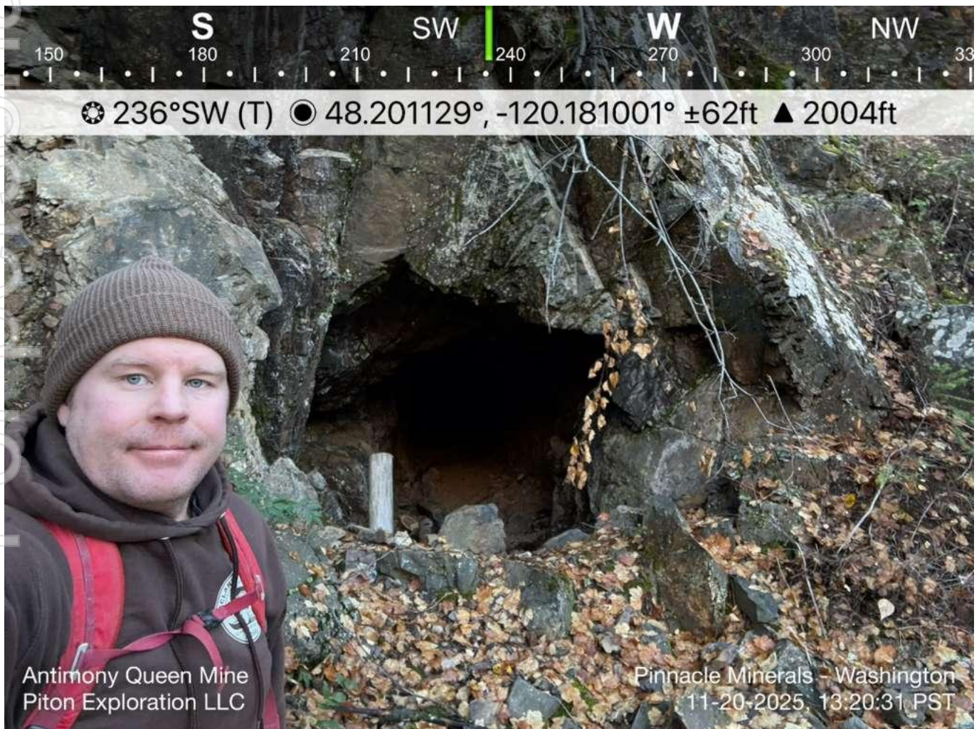
Figure 1 Rock Sampling at Historical Adit 20 Nov 2025

“Antimony Queen strengthens our growing North American footprint alongside our Thunder Mountain Project in Idaho, positioning Pinnacle to play an increasingly important role in the U.S supply chain for critical minerals. We look forward to advancing exploration, defining high-priority drill targets, and delivering value for our shareholders.”