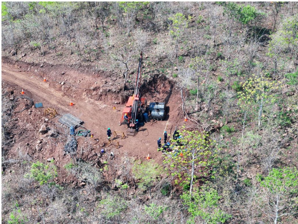
Figure 1: First drill hole underway at the high-grade North Knoll, Kangankunde Rare Earths Project, Malawi.