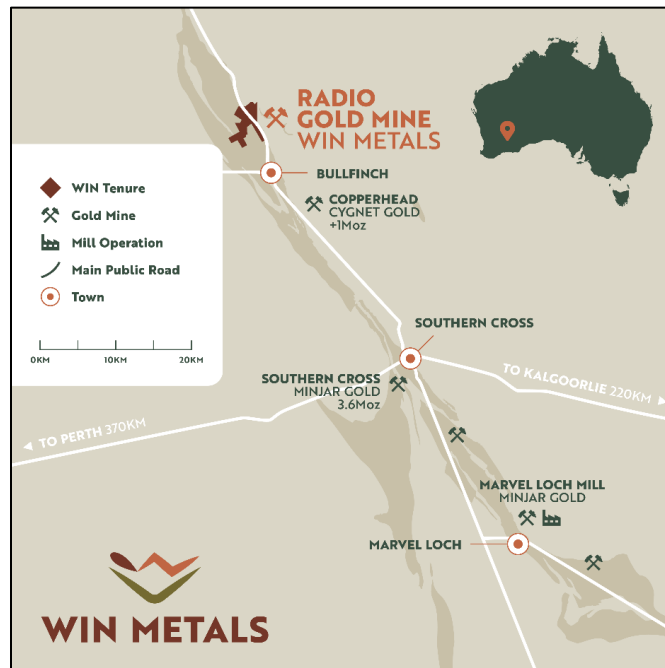
Figure 2: Location of Radio Gold Project

The Radio Gold Project is situated within the Shire of Yilgarn in Western Australia, approximately 8km north of Bullfinch and 38km north of Southern Cross in the Eastern Goldfields region of Western Australia. The site is accessed via the unsealed Mt Jackson Road, providing direct entry to the Project area.