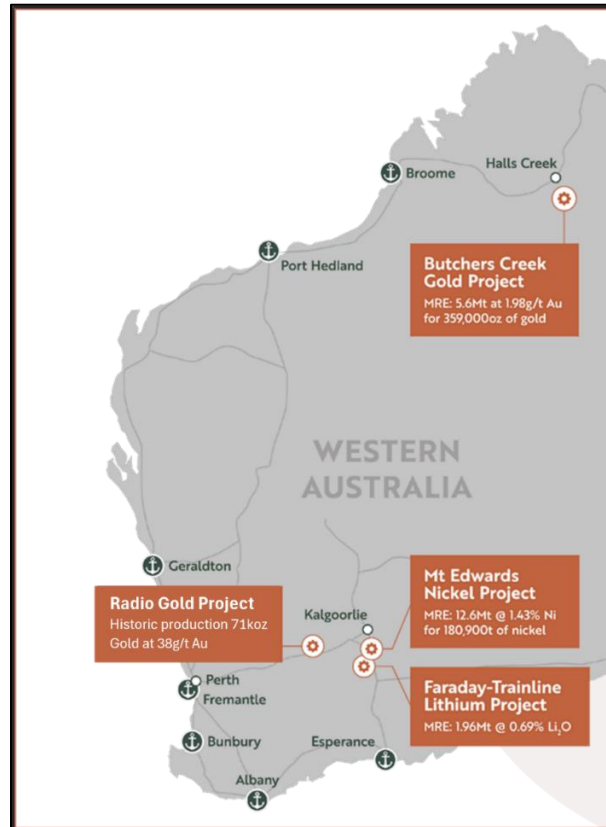
Figure 3: WIN's Gold, Nickel and Lithium Project Locations

Reported above a cut-off grade of 0.30% Li 2 O to a depth of 310mRL (65m below surface) and 0.50% Li 2 O below 310mRL to 250mRL. Tonnes and grade have been rounded to reflect the relative uncertainty of the estimates.