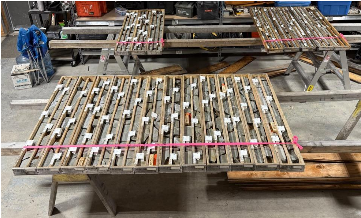
Figure 2. Some of the historical drillcore marked up for due diligence sampling and analysis. CL-20-08 (foreground), CL-21-10 (rear left) and CL-21-21 (rear right)