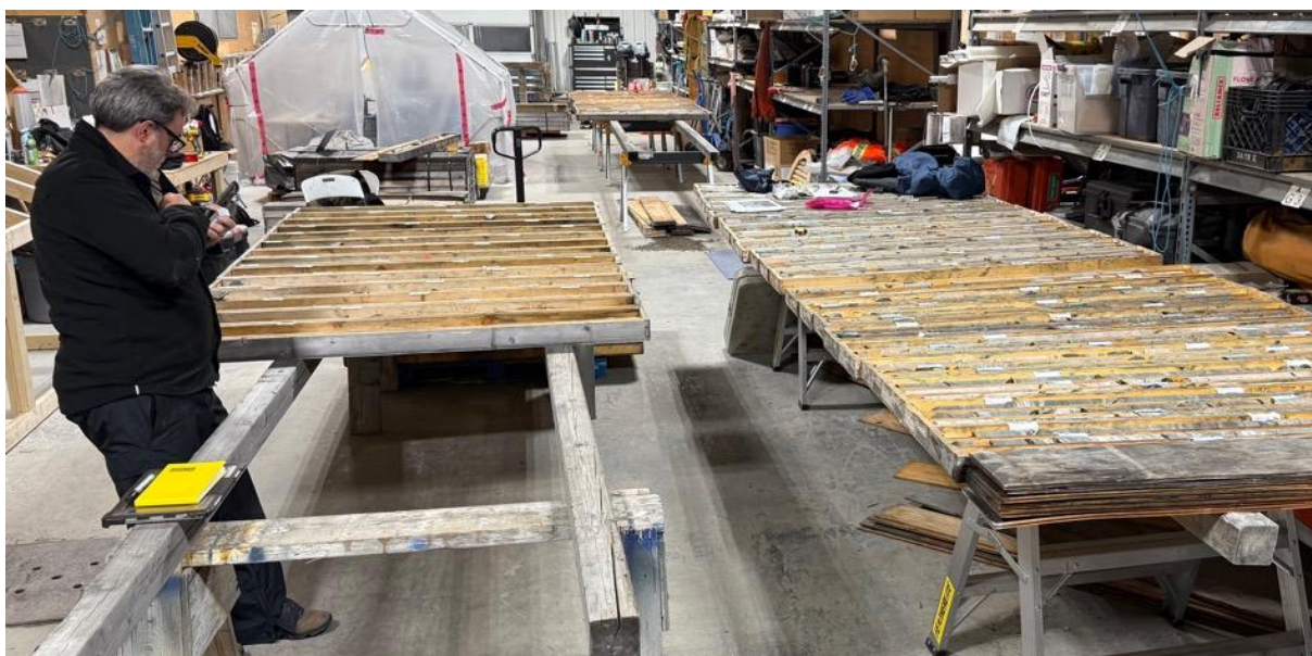
Figure 1. Dr. Solomon Buckman inspecting mineralisation in historical drillcore, as part of FIN’s due diligence review

These opportunities offer near-term catalysts without incurring the extended time frame and costs of deploying a single drill rig.