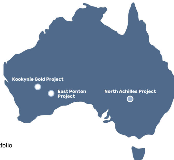
Figure A: Regener8 Exploration Portfolio Project Locations

Sitting within the Kookynie Gold district north of Kalgoorlie, the project hosts substantial historical workings and exploration with intersections including 2m @ 70.5 g/t Au (RC38), 2m @ 15.4 g/t Au (RC315) and 2m @ 11.32 g/t Au (RC391). Regener8's 2023 program found encouraging results which included 5m @ 3.18 g/t Au (NGRC017) and 2m @ 7.77g/t Au (including 1m @ 14.8 g/t Au in NGRC037).