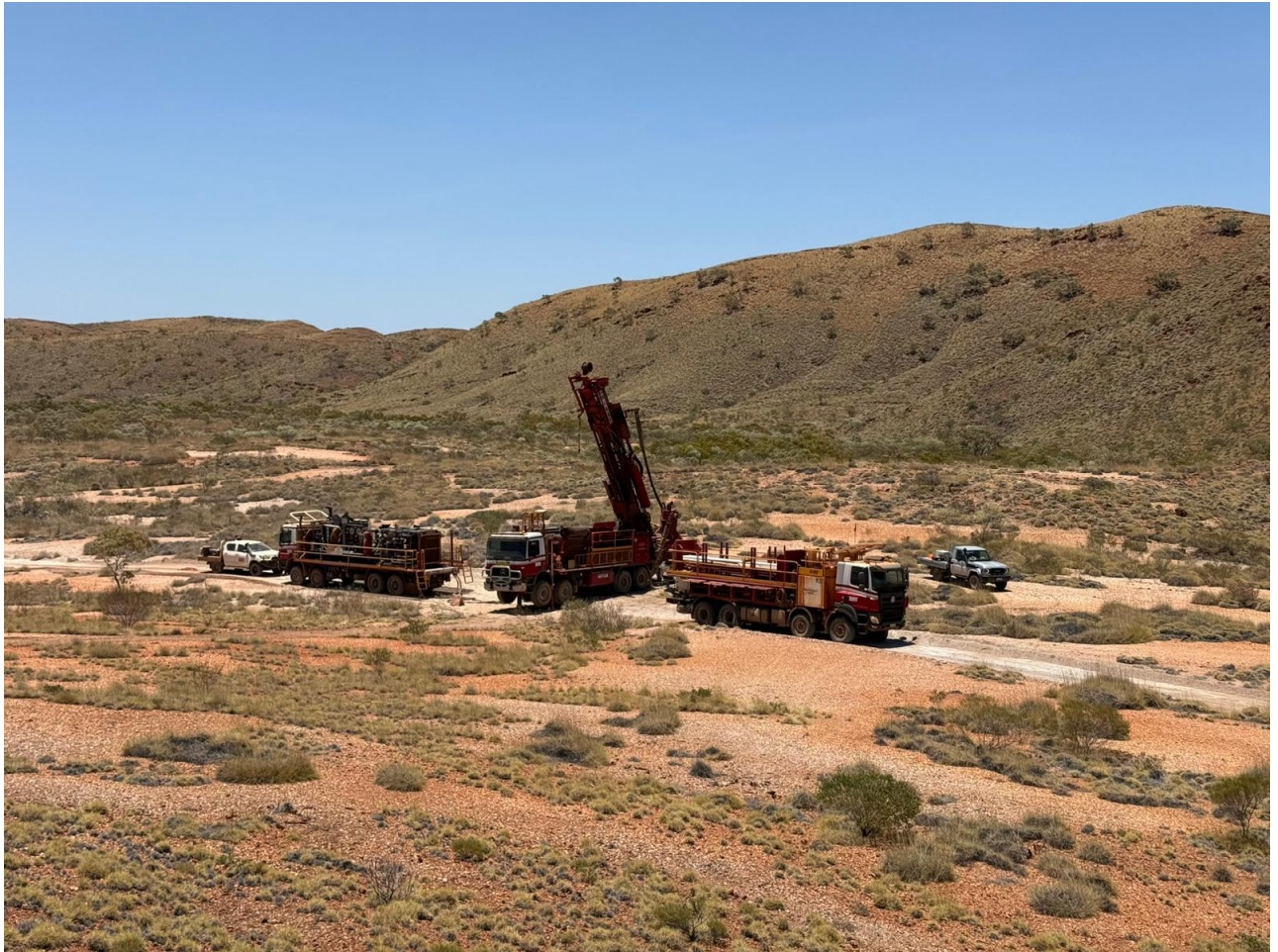
Figure 1: RC drilling has commenced at Swan Gold Prospect.