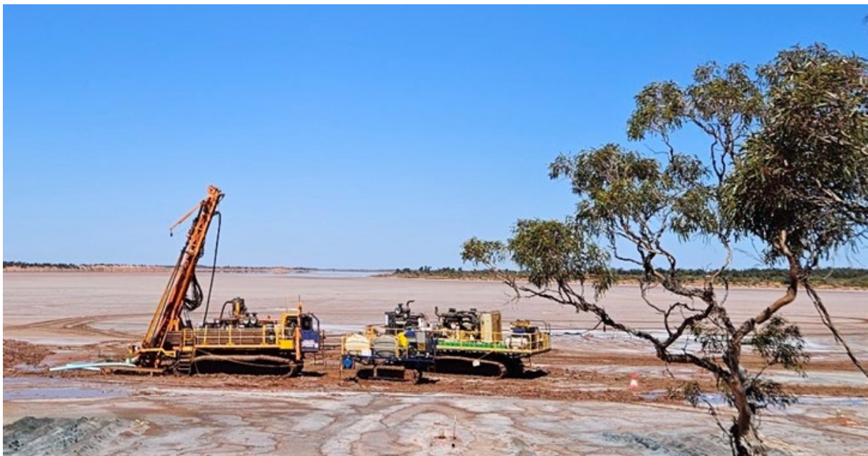
Figure 1: RC Drilling Underway targeting high-grade resource extensions at Burns Central

Lefroy Exploration Limited (“Lefroy” or “the Company”) (ASX: LEX) reports on RC drilling underway at its Burns Gold Deposit targeting the deposit’s high-grade gold corridor. Burns lies