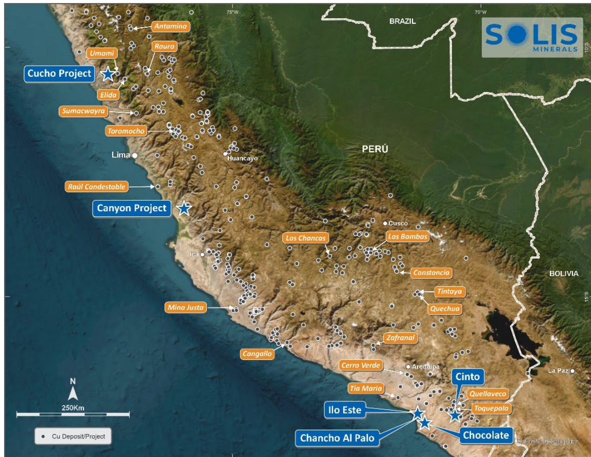
Figure 5: Solis Minerals' portfolio of projects in Peru (blue boxes) with major mining operations and projects also identified.