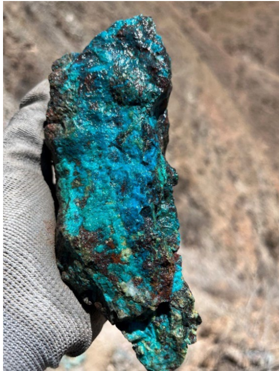
Figure 4: LHS: Cinto surface grab sample 17142 with visible copper oxides and silicification returned 7.14% Cu RHS: Grab sample 17181 (1.0 % Cu) with copper oxides and hyaline quartz from outcrop 7