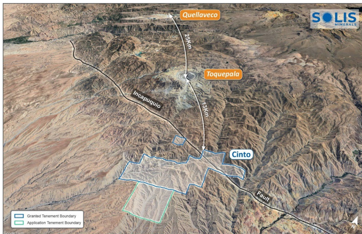
Figure 1: Proximity of Cinto to Toquepala and Quellaveco operating mines

“We are very happy to have received permits to drill at Cinto. Cinto has an excellent combination of an outcropping mineralised footprint, proximity to globally significant copper mines and regional infrastructure. We are very excited to bring shareholders along Cinto’s exploration journey.”