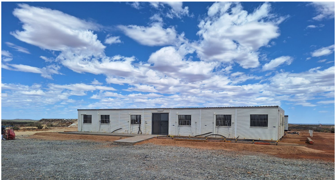
Figure 8 – Underground mining offices

Construction of the site office has also reached practical completion, with the mining offices for Rox and Byrnes staff ready for occupation.