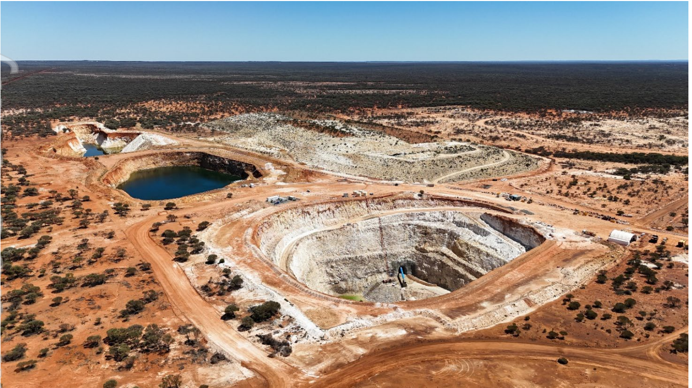
Figure 6 – United North, Kathleen and Rebel pits, looking to the north