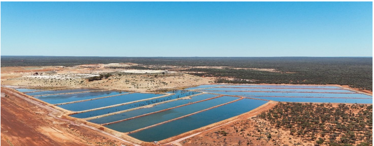
Figure 5 – Evaporation ponds, looking to the north