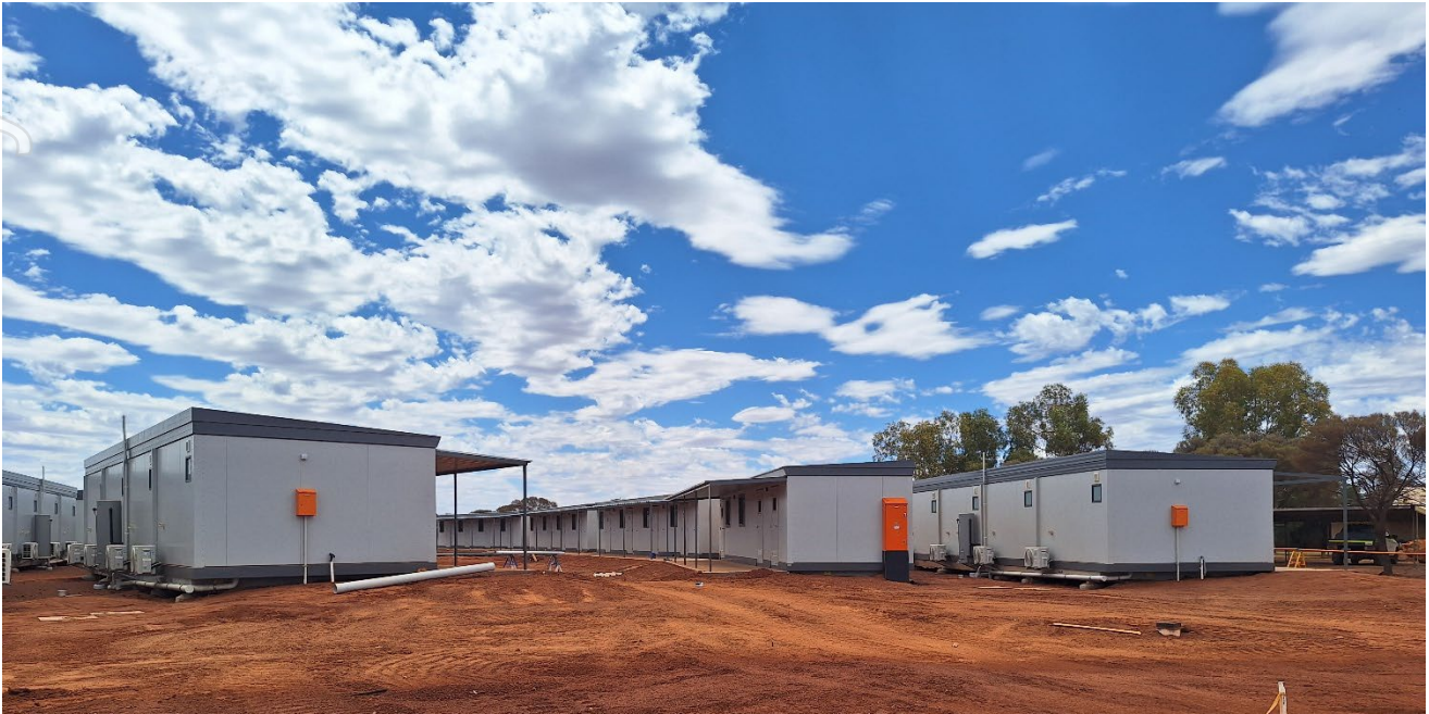
Figure 7 – Phase 1 camp expansion

Construction of the site office has also reached practical completion, with the mining offices for Rox and Byrnes staff ready for occupation.