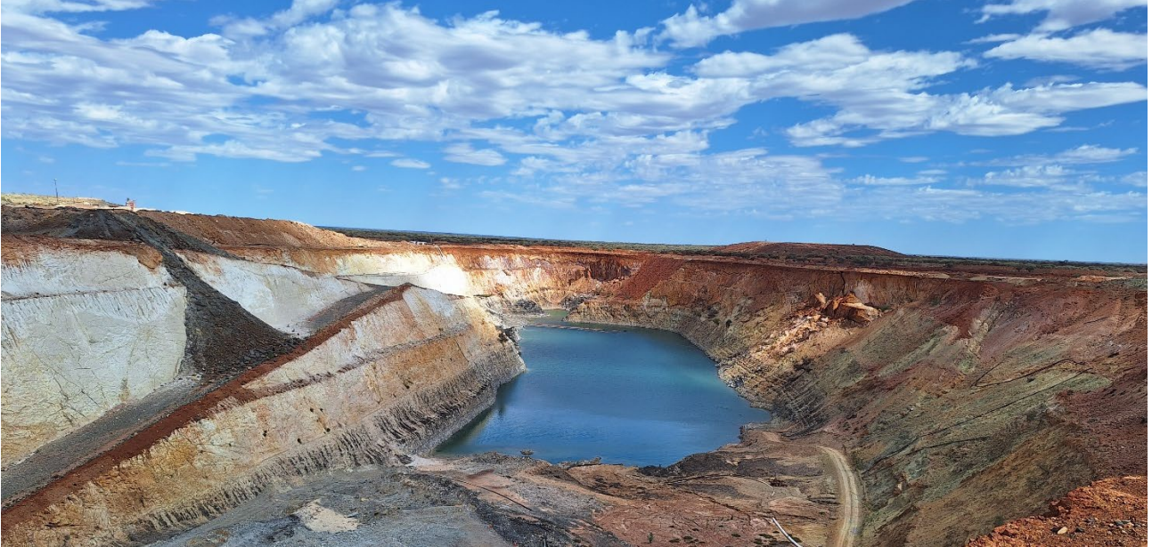
Figure 4 – Youanmi Main pit dewatering

Pumping has continued as planned at Main pit (see Figure 4), discharging to the evaporation ponds (see Figure 5) and Kathleen pit (see Figure 6). Dewatering remains on schedule to be completed in Q1 CY2026. Evaporators will be commissioned shortly, with a separate pump feed, to maintain this timeline.