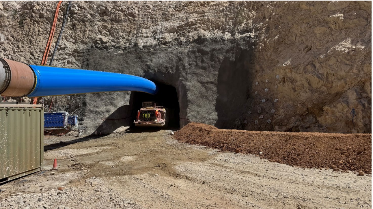
Figure 1 – United North portal established