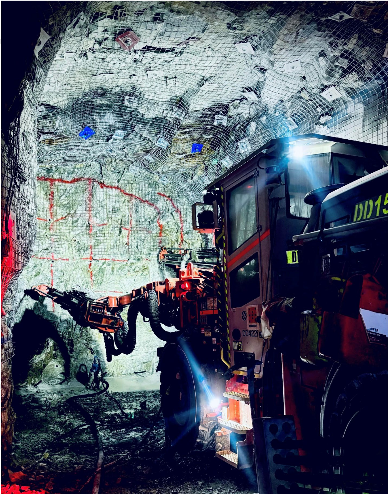
Figure 3 – Jumbo working at decline face