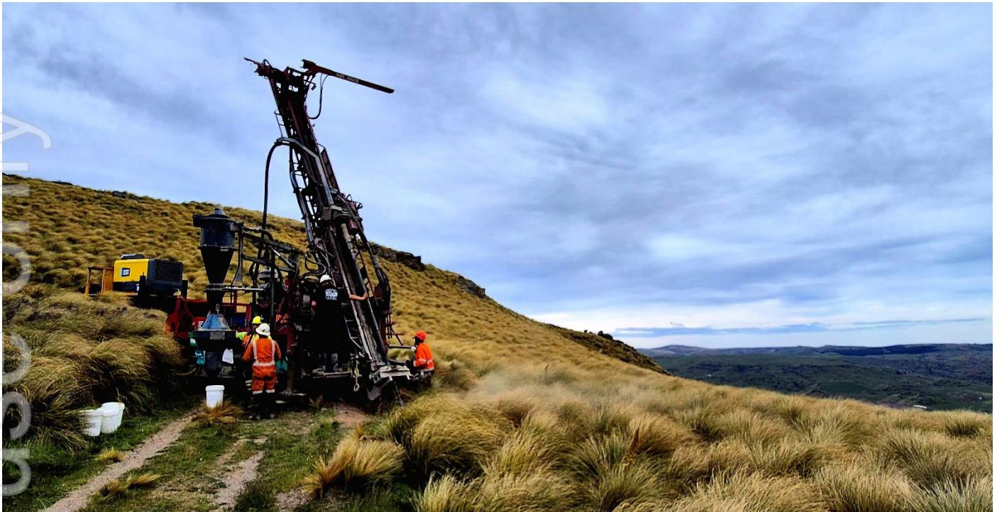
Figure 1 – Multi purpose drill rig at Cap Burn Gold Project with OceanaGold Macraes Operations on the horizon.