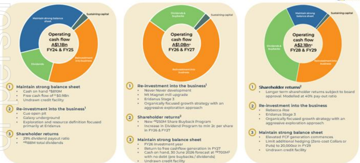
Figure 1: Ramelius Capital Allocation Priorities FY24 to FY29