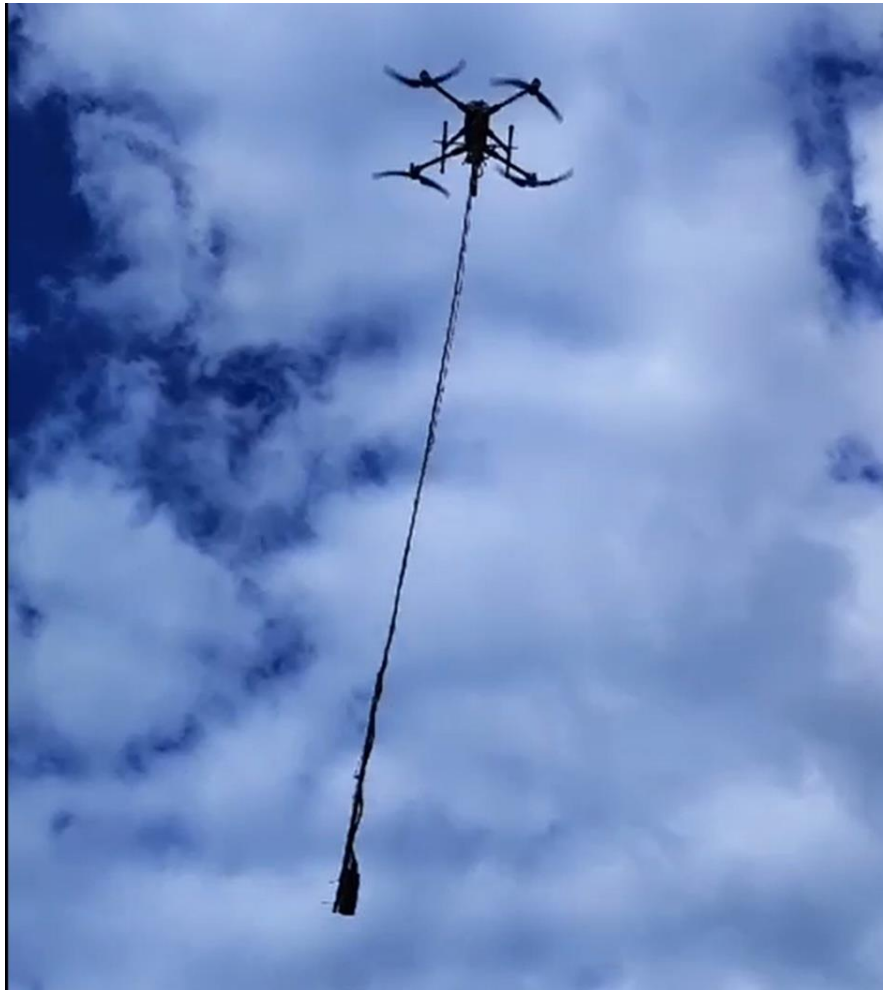
Figure 1: Magnetometer sensor below the drone at Santa Anna

“As we look to accelerate the exploration of Santa Anna following the completion of our acquisition, we are pleased to have completed this drone aerial survey to help us further understand the geology and identify the best areas for follow-up.