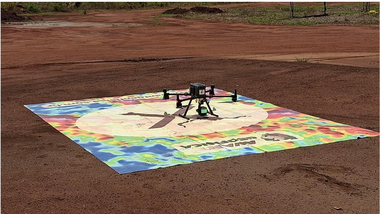
Figure 2: LiDAR sensor mounted below drone while on landing pad at Santa Anna

A highly accurate digital elevation model (DEM) survey was conducted using LiDAR and a RTK GPS system before the drone magnetic survey. This data will support logistical planning for ongoing and future fieldwork, as well as the ground surface on any resource modelling.