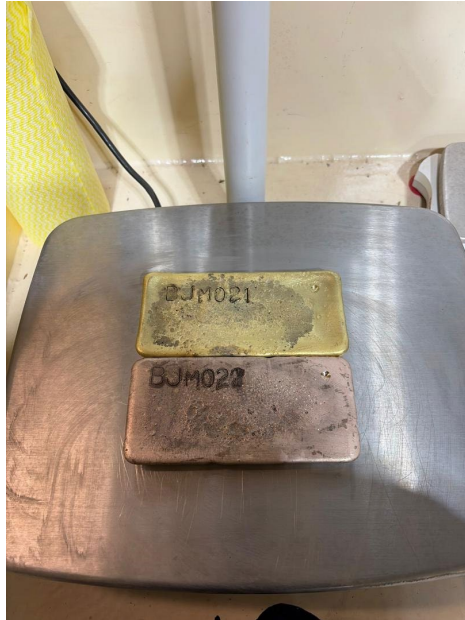
Figure 2: BJM021-022 – 132.8oz gold doré smelt on 3 Dec 2025, gold outturn of 86.76oz

Native Mineral Resources Holdings Limited (ASX: NMR) (“Native Mineral Resources” or the “Company”) is pleased to provide an operational update for its Charters Towers Gold Project, including further gold pours and progress across the Blackjack and Far Fanning operations and the Haoma joint venture.