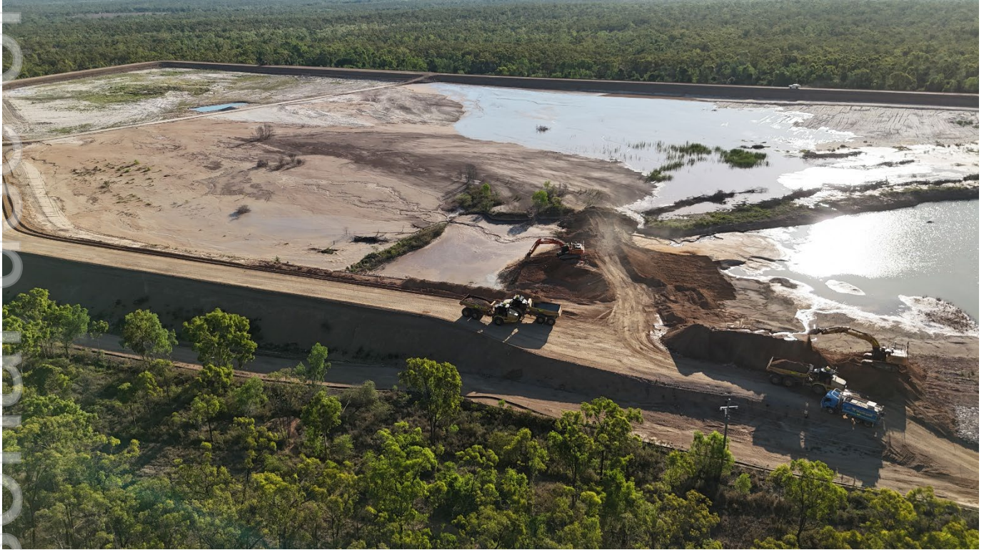
Figure 3: 10 th Layer (Final) In progress with downstream lift and final upstream lift for Lot 1 and Lot 6