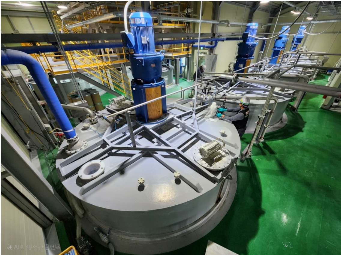
Figure 2: Equipment at Hydro Lithium's refinery in South Korea