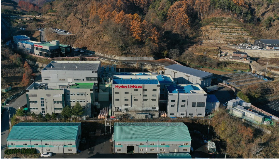
Figure 1: Hydro Lithium's refinery in South Korea