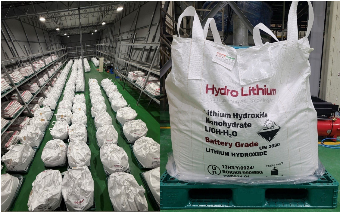
Figure 3: Battery Grade Lithium Produced at Hydro Lithium's Refinery in South Korea