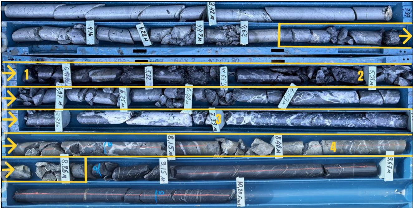
Figure 2 Photo of the mineralised antimony zones (yellow box) within drillhole UG25ZOP003 (wet) showing area from reference point 1 to 2 as a massive stibnite (>80%) zone and a zone of quartz – sulphide - stibnite breccia (noted by 3; see closeup in Figure 1) and antimony veinlets 4. Drilling prior to the antimony zone is enriched in arsenopyrite sulphide alteration which may contain gold. Assays are pending for this hole and are expected in December 2025 to January 2026. Note: Visual estimates of mineral abundance should never be considered a proxy or substitute for laboratory analyses where concentrations or grades are the factor of principal economic interest. Visual estimates also potentially provide no information regarding impurities or deleterious physical properties relevant to valuations.

All drilling and field work has now ceased with the onset of late Autumn snowfalls. The Company looks forward to recommencing drilling in Q2/2025.