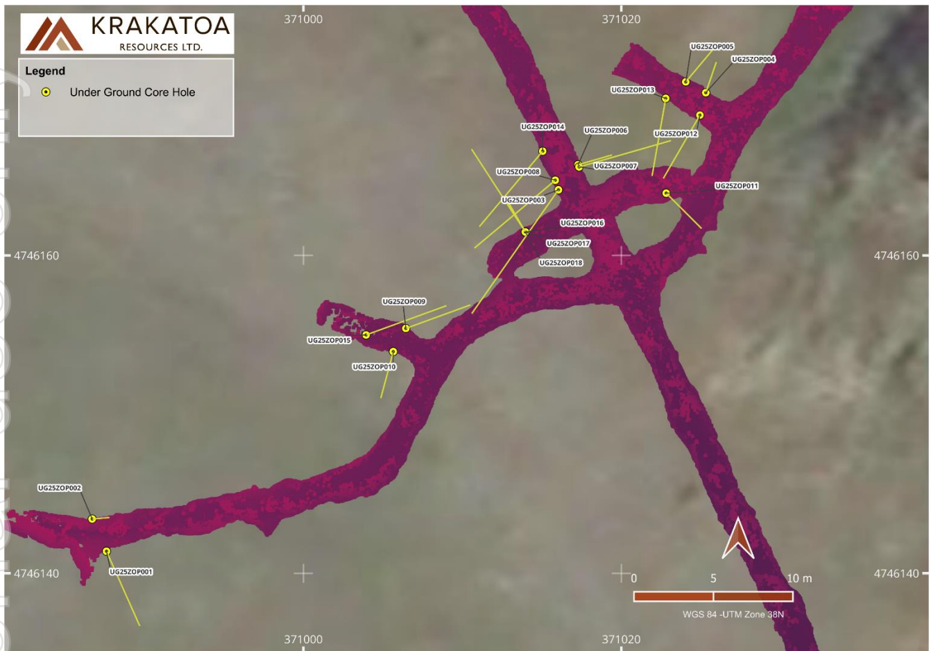
Figure 1 Plan view showing the locations of the underground core sampling drill holes in relation to the adit. LiDAR surface profile.

The Company undertook this work with a modified 41mm “Shaw Portable Coring Drill” kit which is ideal for conducting shallow (up to 20m) core drilling in confined spaces. This drilling will test the antimony mineralisation system and the expansive margins for the presence of gold.