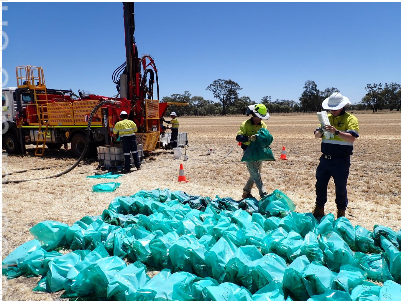
Figure 2. AC drilling at FJ Prospect with Magmatic staff

The trial IP survey has commenced, consisting of up to 9 line-km of IP across the Corvette-Kingswood sulfide mineralisation and Calais. If results of the initial 4 line-km section are successful, the eastern section of the northern line and the southern line will be completed. IP is an electrical geophysical method designed to identify disseminated sulfides. A high energy system has been selected to increase depth penetration and identify disseminated sulfides associated with porphyry copper-gold mineralisation.